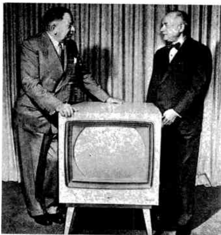
RCA President Frank M. Folsom (l.) and Brig. Gen. David Sarnoff, Chairman of the Board, with RCA's new $495 "Aldrich" color TV set, one of the 1956-57 line.