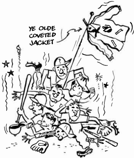
FIGHT FOR TOP O' THE HEAP...

It was only the end of June, but the CHRA Men's Softball League was all tied up "neat as a Christmas package" with Color TV, Servad and Serfin sharing first place with five wins and two losses each, while Production Control and the Spartans were locked together for second place—each with three and four records.