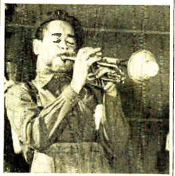
DIZZY GILLESPIE "They . . . didn't understand"

any prejudice the general publie might feel against re-bop. "Because," he said, "in real re-bop there just aren't any lyrics to be suggestive."