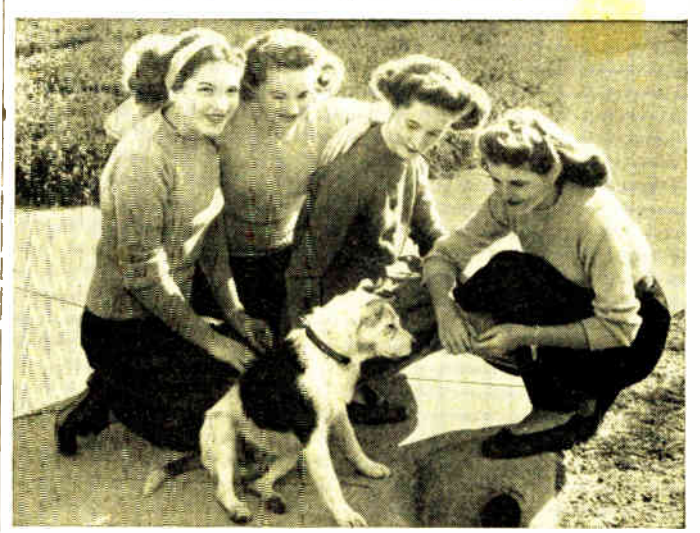
THE "MOON MAIDS" AND SPOT