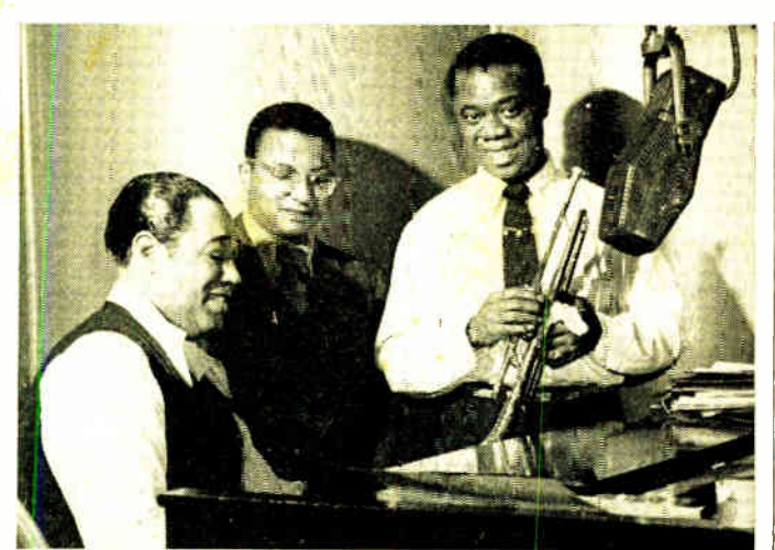
ELLINGTON, STRAYHORN, ARMSTRONG Their talents were joined