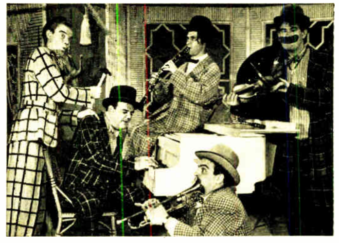
SPIKE JONES AND SLICKERS In a scene from their latest picture "Breakfast in Hollywood."

With millions of radio fans now solidly behind them, the boys begin their RCA VICTOR career with staunch supporters awaiting their further discs.