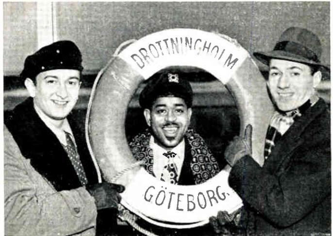
Here is perhaps the greatest exponent of Be-Bop today, Dizzy Gillespie, as he returned from his European concert tour. (See IN THE GROOVE , April, 1948)

"Yes, it's a real fight—and New Orleans is the last frontier!"