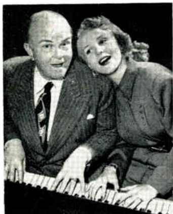
Songstress Peggy Lee and comedian Victor Moore take time out during rehearsal for a bit of close harmony.