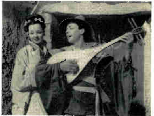
Reading from top to bottom: A scene from Pecos Bill in "Melody Time." Kenny Baker sings in the Mikado and Robert Preston introduces Danny Thomas to Karin Booth in "Big City."

● THE MIKADO: This is a glorious technicolor production of the most tuneful and delightful Gilbert and Sullivan. Done by the world famous D'Oyly Carte Opera Company and starring Kenny Baker. It is available in the complete version in RCA Victor's imported HMV Album DB-8105/15.