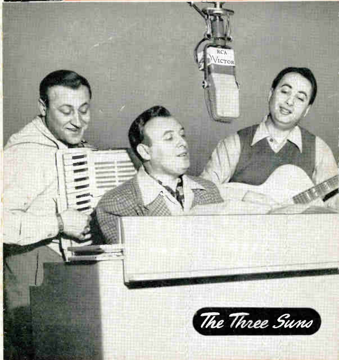
The Three Suns