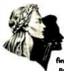
finest tone system in RCA Victor history

Plays on AC or DC house current or on its long-life RCA battery. Lightweight—in durable maroon plastic with non-tarnish golden finished trim and a handsome saddle of smart luggage-type covering. It's a welcome companion at home or wherever you go! $34.95* less battery.