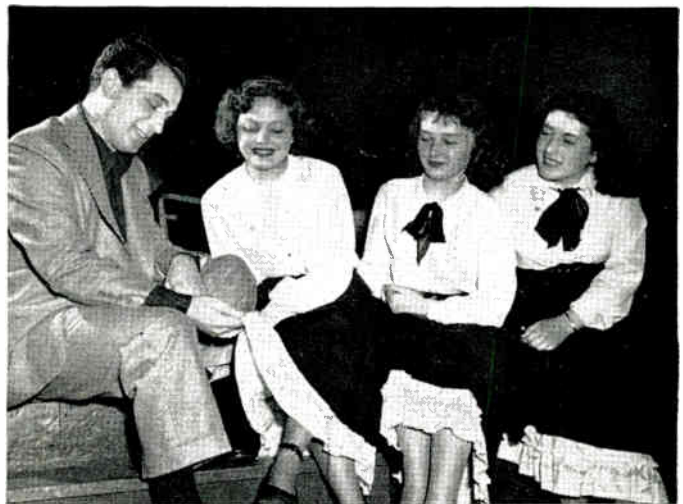
News: Perry Como examines the new "Pianissimo Petticoat."

Johnny Applesseed and I became such good friends during the production of the picture that I've lost my taste for apple pie. It gets awfully tiresome just eating the cheese!