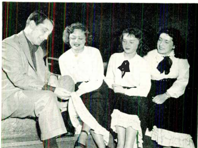
News: Perry Como examines the new "Pianissimo Petticoat."

Johnny Appleseed and I became such good friends during the production of the picture that I've lost my taste for apple pie. It gets awfully tiresome just eating the cheese!