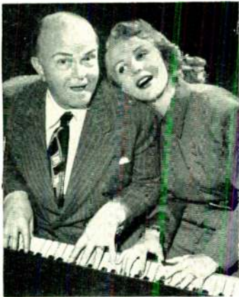
Songstress Peggy Lee and comedian Victor Moore take time out during rehearsal for a bit of close harmony.