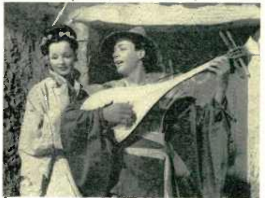
Reading from top to bottom: A scene from Pecos Bill in "Melody Time." Kenny Baker sings in the Mikado and Robert Preston introduces Danny Thomas to Karin Booth in "Big City."

● THE MIKADO: This is a glorious technicolor production of the most tuneful and delightful Gilbert and Sullivan. Done by the world famous D'Oyly Carte Opera Company and starring Kenny Baker. It is available in the complete version in RCA Victor's imported HMV Album DB-8105/15.