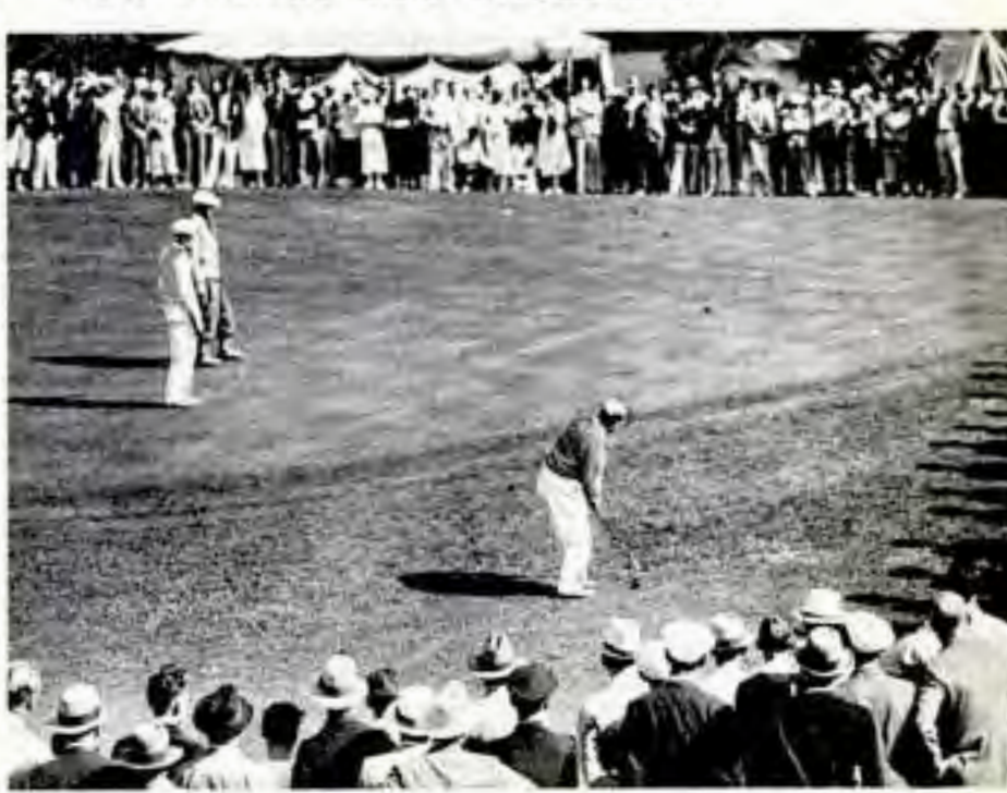
NBC TELLS YOU ABOUT GOLF!