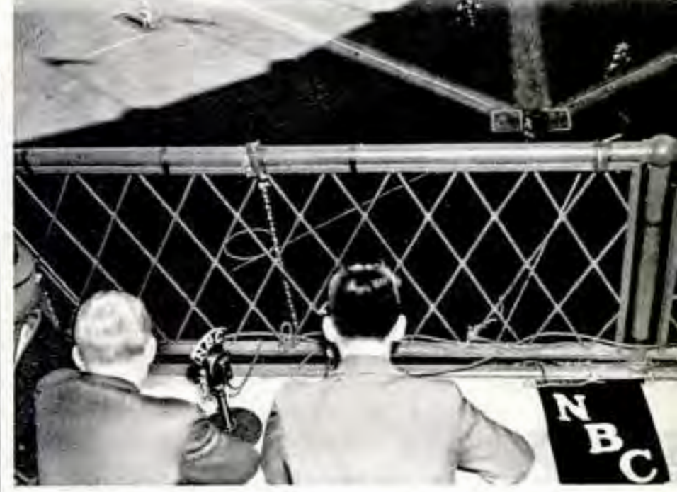
NBC BRINGS YOU BASEBALL!