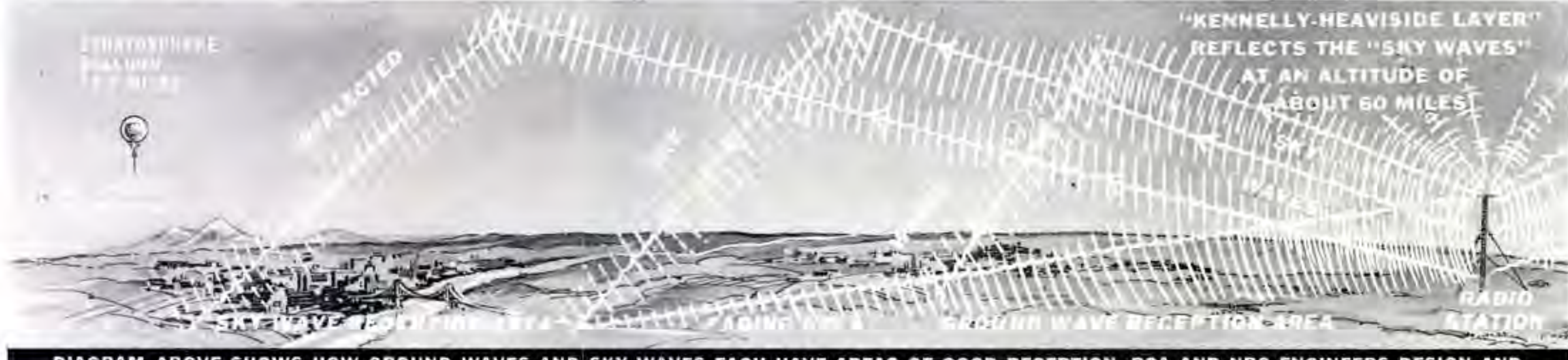
DIAGRAM ABOVE SHOWS HOW GROUND WAVES AND SKY WAVES EACH HAVE AREAS OF GOOD RECEPTION. RCA AND NBC ENGINEERS DESIGN AND OPERATE NBC STATIONS TO PREVENT OVERLAPPING OF THESE WAVES AS FAR AS POSSIBLE.