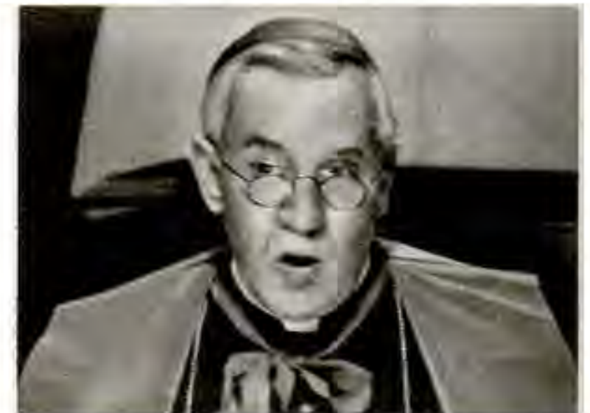
His Eminence, the late CARDINAL HAYES who inaugurated The Catholic Hour over National Broadcasting Company networks.