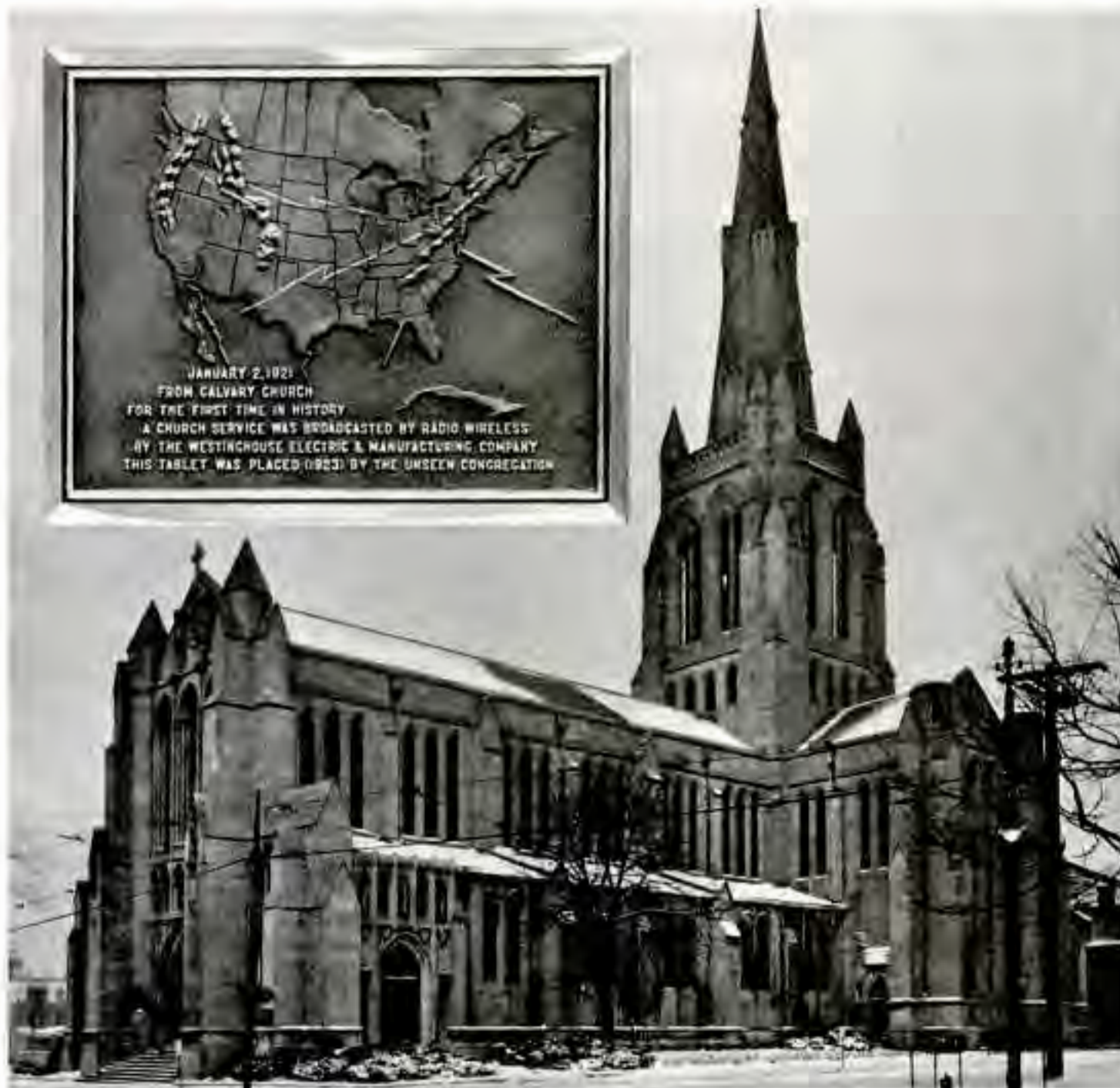
FIRST BROADCAST OF A CHURCH SERVICE

As an "assertion of the American principle of religious freedom" there is being erected at the New York World's Fair, 1939, a Temple of Religion, sketch of which appears above. Funds for the building, maintenance and operation of this edifice are being provided by lay members of the great religious faiths. From this fine building will originate many broadcasts, featuring distinguished speakers and famous choirs.