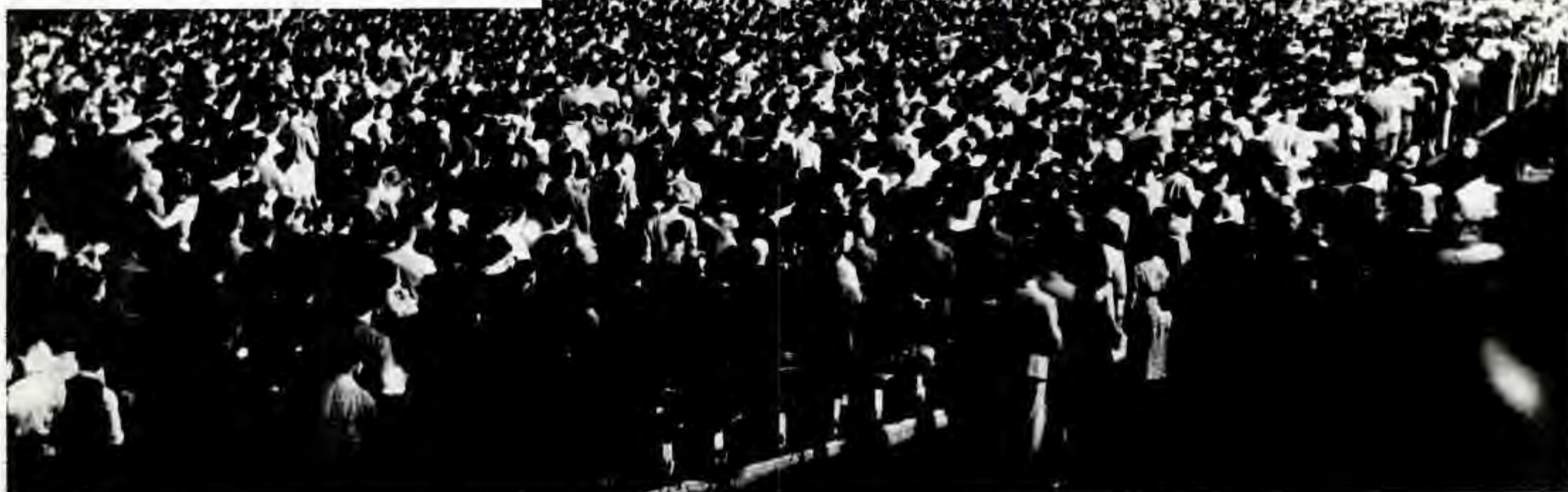
VIIIth NATIONAL EUCHARISTIC CONGRESS ATTENDED BY THOUSANDS, BUT HEARD BY MILLIONS

works live after them, for it was they who were largely responsible for perfecting plans whereby NBC instituted regular religious broadcasts over its networks. At this time the National Broadcasting Company networks send out eleven religious programs each week, to the 64,000,000 registered communicants of all faiths, and to all others who listen.