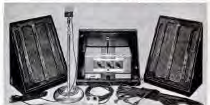
RCA Victor Church Sound System PG-114... $299.50* complete with microphone, two speakers, RCA Metal Tube Amplifier and long inter-connecting cables. Prices on other Systems fitted to individual churches, range from $175* up.

This RCA Victor Church Sound System enables everyone to hear every spoken word—and the full beauty of songs and music—clearly, distinctly and without strain.