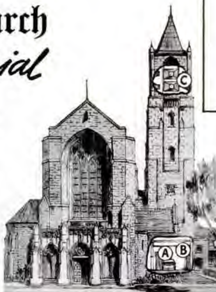
"A" is keyboard and chime mechanism, "B" is the amplifier, "C" the speakers in tower.

The chimes illustrated at left provide five notes. Others are available up to 49 notes. Prices, which range from $475* up include standard amplifier and speaker equipment.