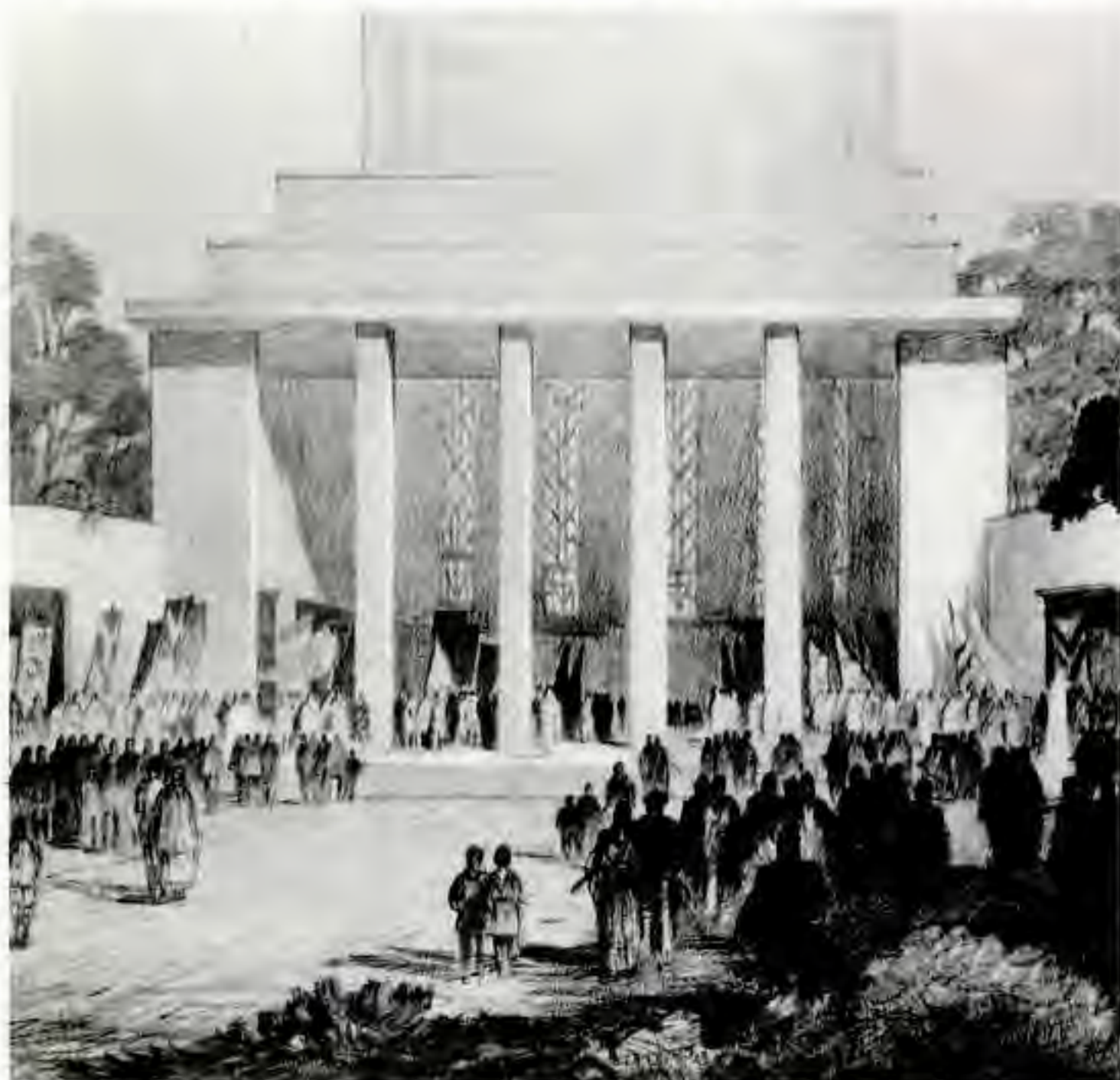
TEMPLE OF RELIGION AT THE WORLD OF TOMORROW

in October, 1938. The photograph above shows impressive scene as thousands saw—and millions heard—one of the night ceremonies during this great religious celebration.