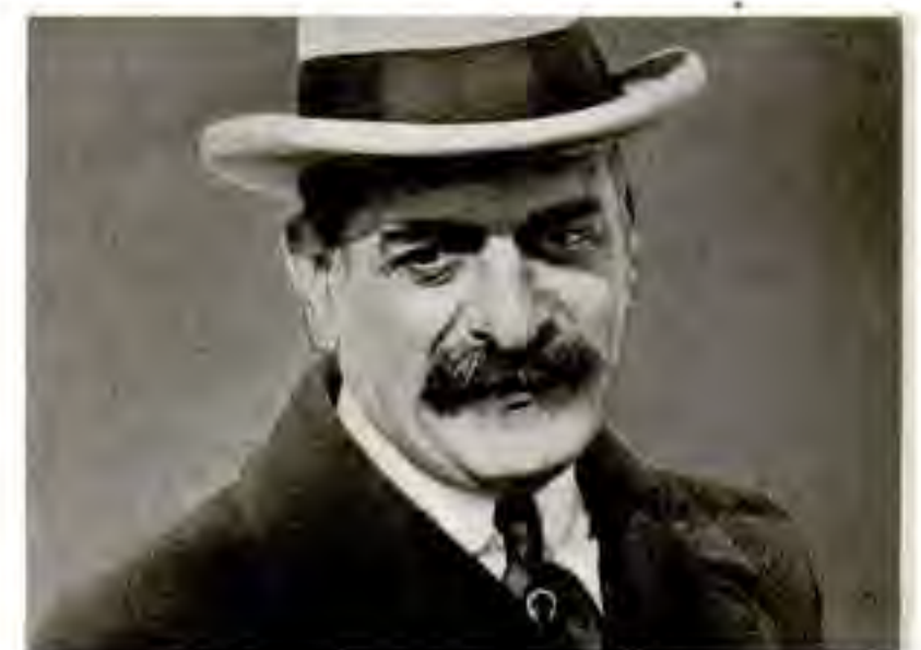
Religious broadcasts for those of Jewish faith were made possible through the activity of a great Jewish layman, the late FELIX WARBURG .

Easter dawns gloriously as millions listen—One of the most inspiring of religious events is the Easter Dawn Service in the Hollywood (California) Bowl. Shown above are the thousands who gather for this service. Radio has vastly extended the inspiration of such occasions by reporting the events in detail, and bringing the voices of speakers, and the traditional music of great choirs to millions of listeners in their homes.