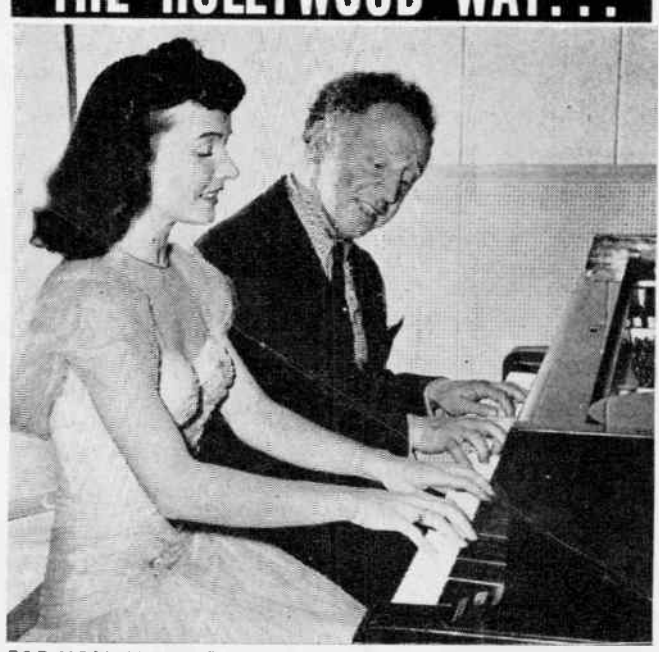
FOR HOLLYWOOD Rubinstein recorded sound track for Republic's "I've Always Loved You" in which Catherine McLeod starred.

Rubinstein's latest record release, out this month, is a new album of Schumann's Fantasiestücke, Op. 12.