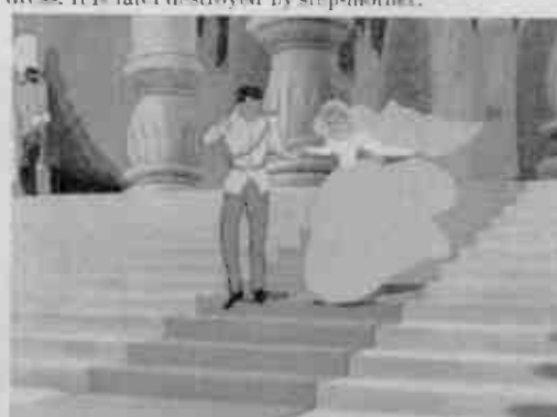
THE END of movie shows wedging of turns out for cer mony, including mice.