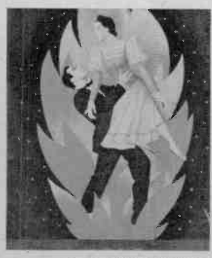
CONTRAST between Timing's method and album art is shown by comparing his work with covers for "Transfigured Night" (Jell)