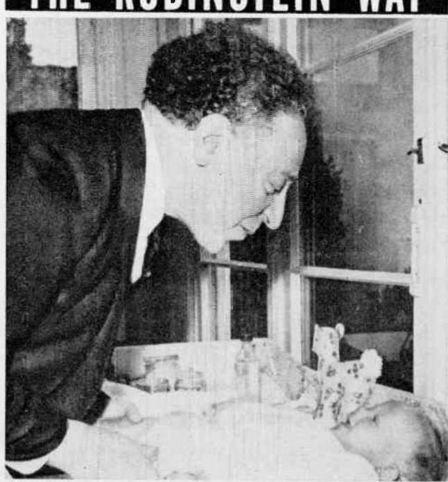
FOR WORLD'S ARTISTS he is seen in movie which was in his own home and which shows him with his wife and family. Above photo, taken some years ago, is typical scene.