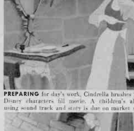
PREPARING for day's work. Cindrella brushes hair. Di nev characters fill movie. A childen's album u ing sound track and to y is due on mark t soon.