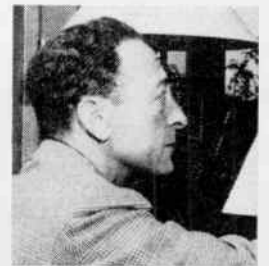
record: "On Wings of Song." new record of "Ave Maria."