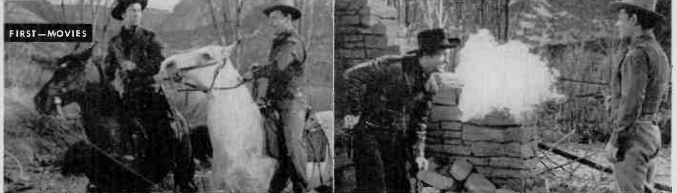
"BILLY THE KID" WAS IN 1941 FILM WITH ROBERT TAYLOR (ABOVE) AS STAR. LEGEND WAS ALSO USED IN "OUTLAW," 19 OTHERS