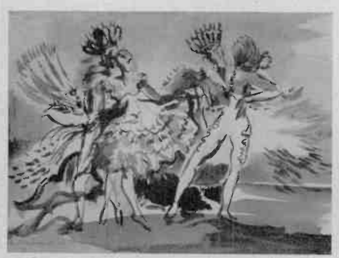
DVORÁK'S "SLAVONIC DANCES" make the of abstract formulation in dancing figures come torough. At the Fieller and Boston Pops have recorded on both "45" and conventional dies.