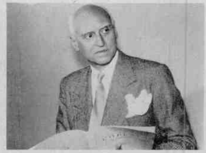
BACK AGAIN to the U.S. came Victor de Sabata recently to guest conduct the Pittsburgh Symphony and the Chicago Symphony. (New record release: "The Fountains of Rome," recorded in Italy.)