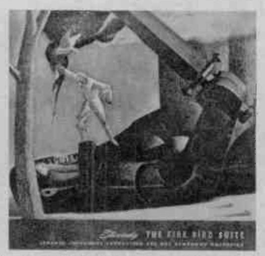
and "Fire Bird" Cover are strength strice for lineral translation of music story. Timing gets his ideas from music itself.