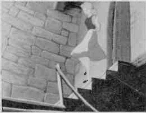
LOCKED IN TOWER, Cinderella escapes and tries on glass slipper to win the prince. Love song in film prince and Cinderella. Whole kingdom is "So This Is Love." (Vaughn Monroe has disc.)