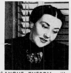
lease: "Mélancolie" (Chopin), condita Armonia" ("La Tosca.")