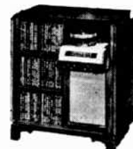
The swing's to "45" Victrola 45W9

SAMMY KAYE—I Thought She Was a Local (20-3828/47-3828) This one is really something different for Sammy. A country tune! The Kaydets, who sing the very clever lyrics, get into the swing of things with a vocal that is phrased in authentic hillbilly tradition. This is an extremely catchy tune and Sammy has produced a unique arrangement to go with it. There's a fiddle playing underneath everything that happens on the side and this gives it a real hoe-down atmosphere.