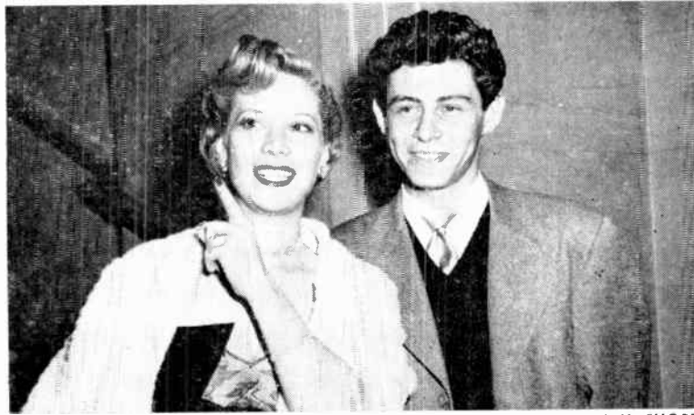
EDDIE FISHER POSES WITH ANOTHER EDDIE CANTOR DISCOVERY, DINAH SHORE