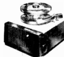
The swing's to "45" Victrola 45EY

HUGO WINTERHALTER—My Destiny & Foggy River (20-3822/47-3822) When I heard Hugo's record of "Count Every Star" I told myself that he'd have a hard time topping it. Well, this one beats it by a mile. "My Destiny" is a new number and Hugo's orchestra and chorus gives it a very full, romantic treatment. "Foggy River" is an oldie and here gets a spirited revival. Hugo's arrangement has the band sounding almost like one big accordion while the chorus sings "against" itself amid a hand clapping beat. You've got to hear this one to appreciate it.