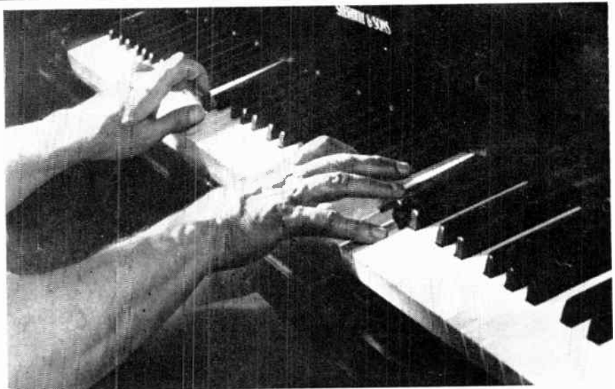
THE HANDS OF ARTUR SCHNABEL HAVE PLAYED FOR AUDIENCES ALL OVER THE WORLD

Artur Schnabel has a few pet peeves concerning his concerts. Whenever he is