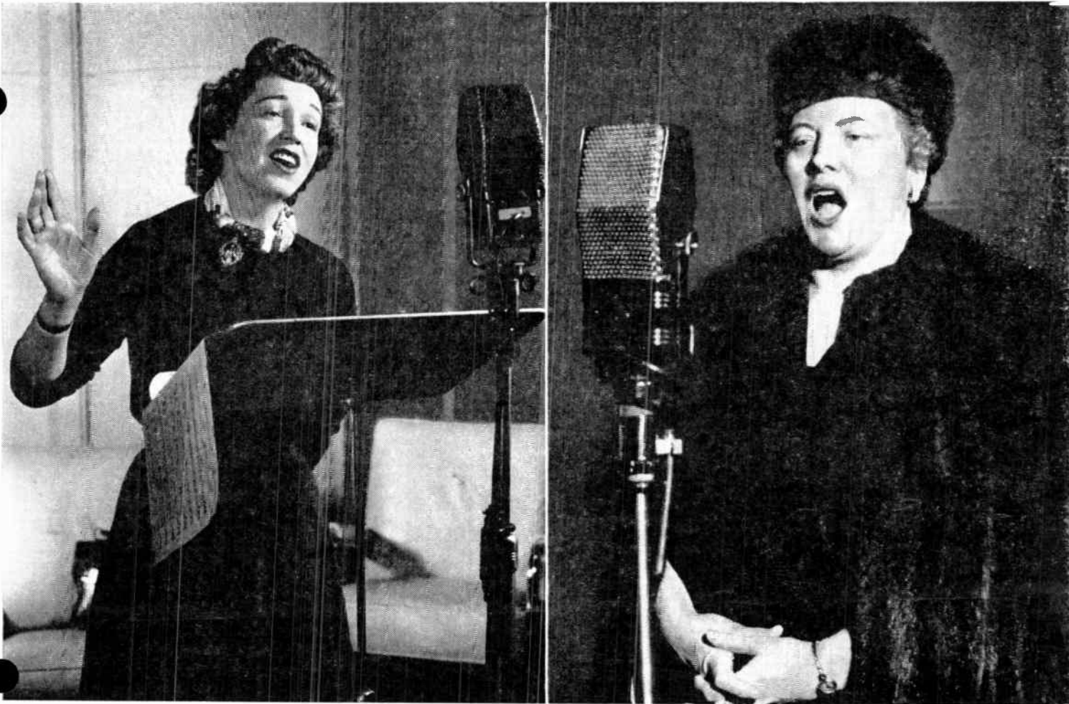
RISÉ STEVENS AND HELEN TRAUBEL RECORD THEIR RESPECTIVE ALBUMS FOR RCA VICTOR RECORDS