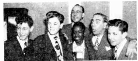
EDDIE CANTOR visited a Philly amateur hour once, posed with contestants; 5 years later he re-discovered Eddie Fisher (left).

With the record date just around the corner, RCA Victor found itself with a large hall and full orchestra of over twenty-five pieces on its hands. It was then that Eddie Fisher showed up. He had just returned to New York after a series of out-of-town appearances. Hastily, two tunes were rounded up and arrangers and copyists put to work. The result: Fisher's latest, and best, record: "Just Say I Love Her."