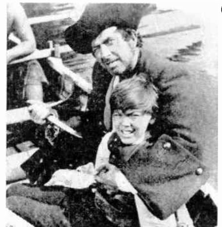
JOHN SILVER captures Hawkins as Hispaniola sails into Treasure Island bay. Below, Jim runs back to stockade after fight in which he has captured ship from pirates.