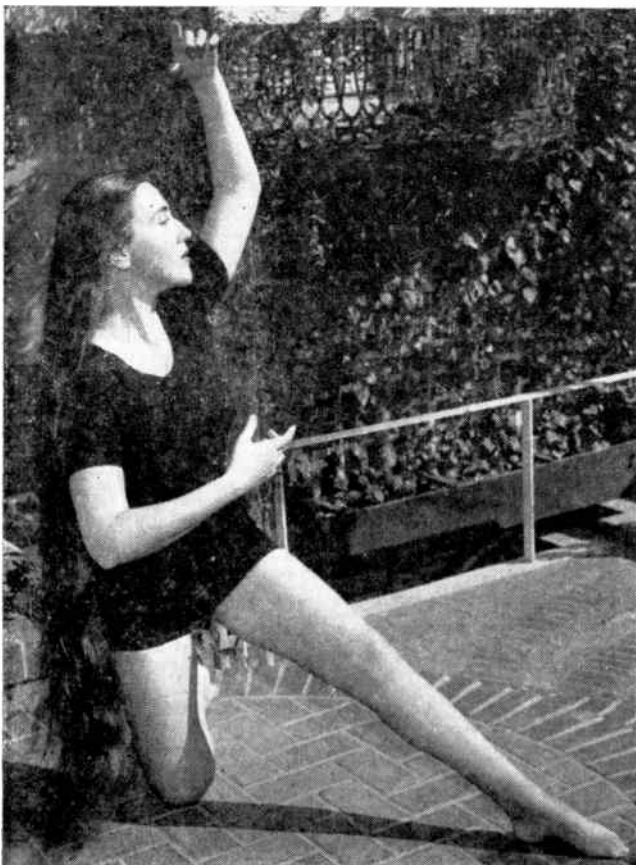
BLANCHE THEBOM DISPLAYS HER FULL TRESSES

Currently Miss Thebom is in Scotland where she is singing at the Glyndebourne Opera. Next fall she may add the role of "Carmen" to her repertoire. Blanche Thebom's latest record release: an outstanding album of Hugo Wolf Songs.