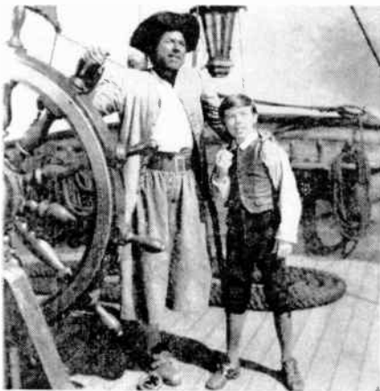
LONG JOHN SILVER AND JIM HAWKINS

Although "Treasure Island" has always been a boys' story it comes alive on the screen as an adventure for everyone. Bobby Driscoll has recorded an album of his "Treasure Island" adventures for RCA Victor.