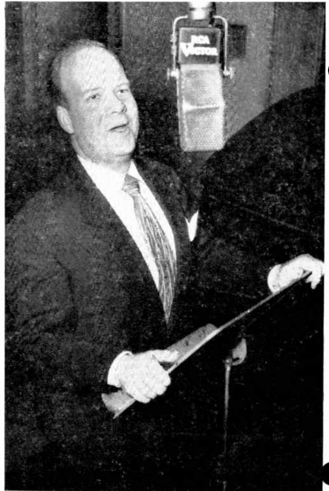
MACK HARRELL RECORDS THE "DICHTERLIEBE" FOR RCA VICTOR