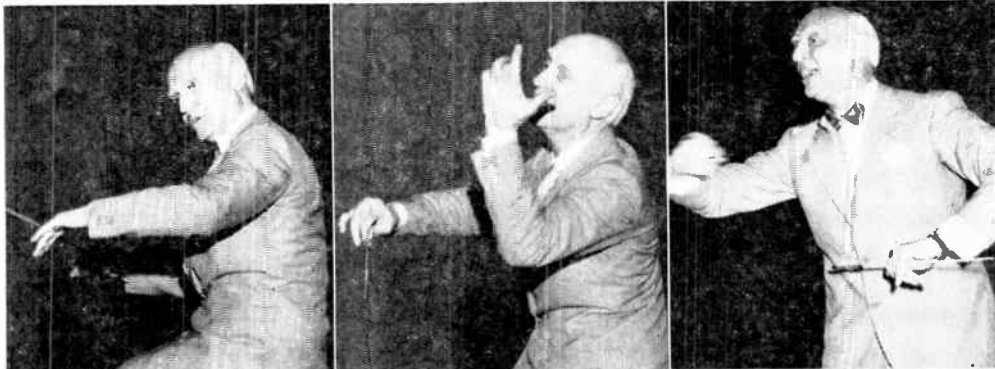
VICTOR DE SABATA CONDUCTS THE SYMPHONY ORCHESTRA OF THE AUGUSTEO, IN ROME