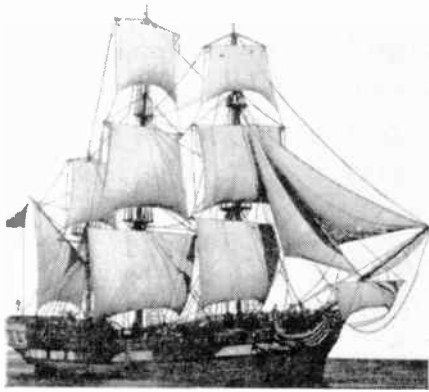
THE HISPANIOLA SAILS TO TREASURE ISLAND