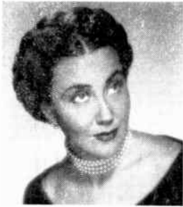
THEBOM WITH HAIR UP