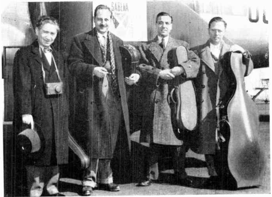
THE PAGANINI QUARTET POSES BEFORE PLANE WHICH TOOK THEM ABROAD LAST YEAR