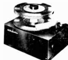
The swing's to "45" Plug in attachment