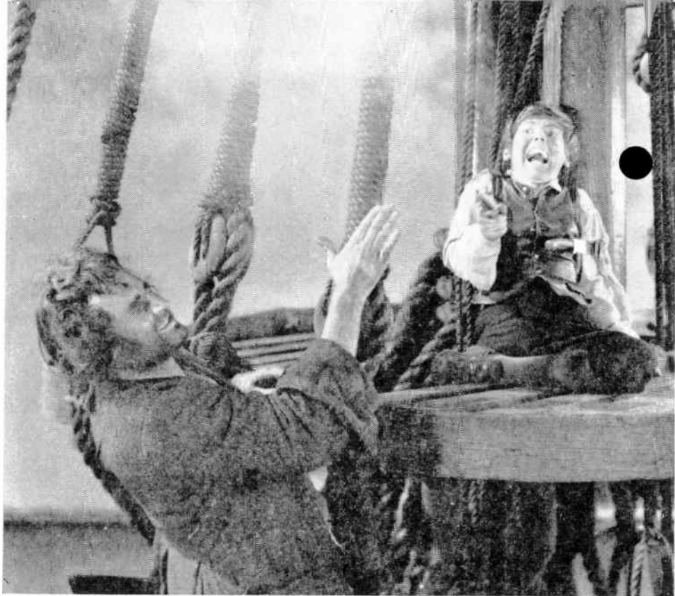
JIM HAWKINS IS STABBED AS HE FIRES AT ATTACKING PIRATE