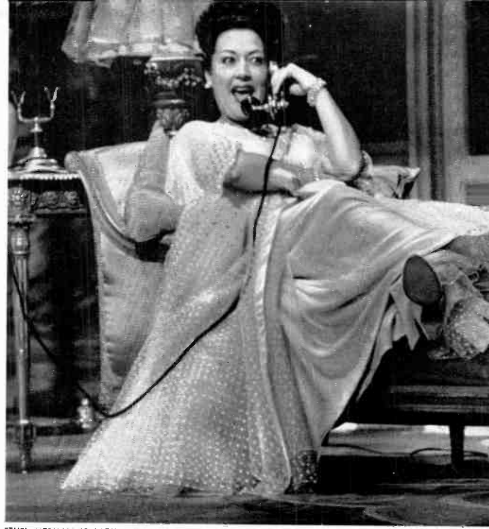
ETHEL MERMAN IS LADY AMBASSADOR IN IRVING BERLIN'S NEW BROADWAY HIT MUSICAL