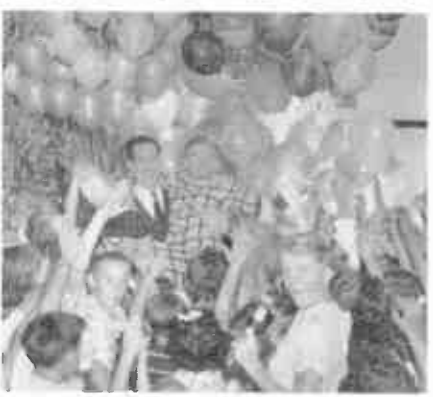
who attended. Spike and the boys also kids at the special Sunday afternoon party. handed out a free popsiele to each child.