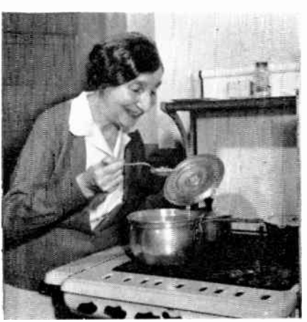
KITCHEN is typical of the old Victorian country house. The living room has almost miraedous acoustical qualities for recording.