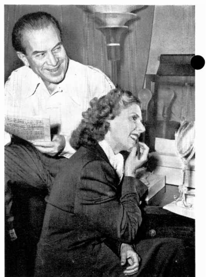
PHIL SPITALNY AND EVELYN POSE BACKSTAGE AT THE CAPITOL