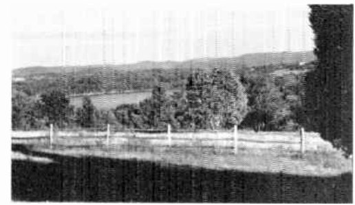
THIS IS THE VIEW FROM LANDOWSKA'S GARDEN