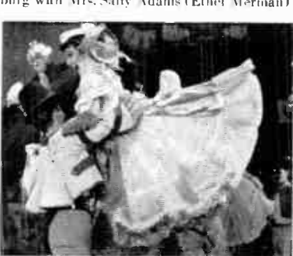
JEROME ROBBINS, who stages show's dances, includes several like this using imaginary European atmosphere that is charming.