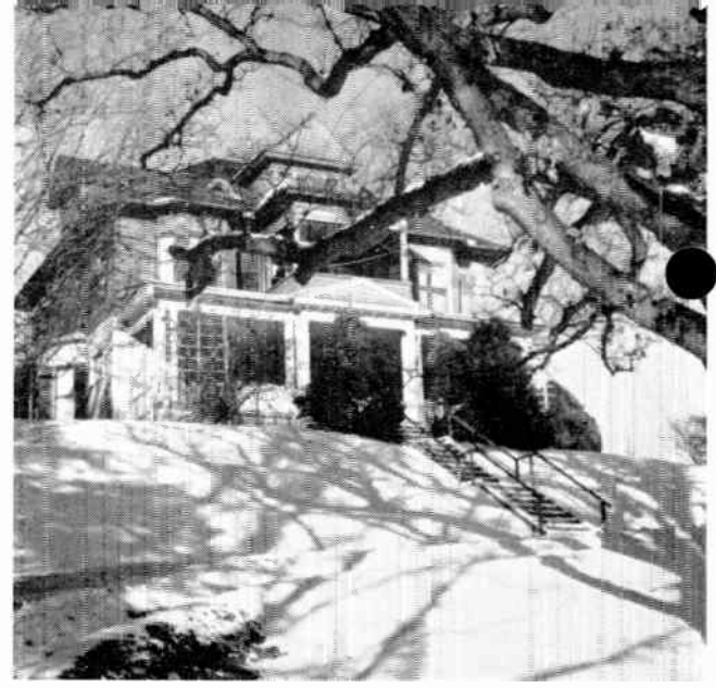
THE FIFTY-YEAR-OLD HOUSE STANDS ON THE TOP OF A HILL

Inside the house on the first floor, everything is devoted to music; the dining-room is a music room, with two grand Steinway pianos. The library is a music room with one Harpsichord grand Pleyel. The living-room is another music room with the other Pleyel harpsichord. In the living-room you will find the dining-room table transformed into a huge desk covered with manuscripts, papers, books, pencils, etc., and every-