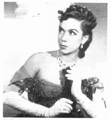
PATRICE MUNSEL will sing the role of Adele in "Die Fledermaus" in 11 of the 15 Met tour cities. She is also heard in RCA Victor's newly issued "Highlights from Die Fledermaus" album with Merrill, Melton, etc.