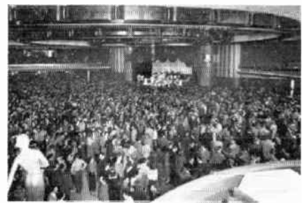
CROWDING into the Palladium for band's first West Coast date were these 5,030 fans. Ralph did best business in 4 years for the famous Hollywood dance palace.