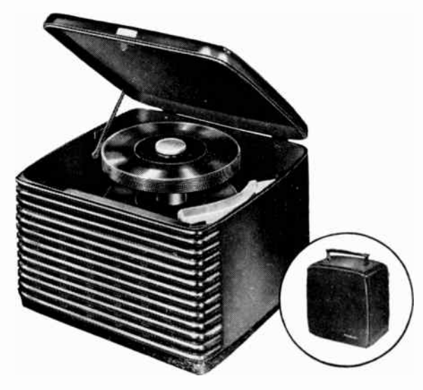
"Victrola". . . T. M. REG. U. S. PAT. OFF.