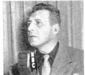
EZIO PINZA was a recent guest on the program. His first disc for RCA Victor, "Yesterdays", is currently available.

"People are a lot smarter than some people think they are." The foregoing are the words of script writer Goodman ("Easy") Ace. whose current assignment is writing material for NBC's Tallulah Bankhead-emceed "The Big Show." That Ace is sticking by his principles is readily apparent to anyone who tunes in "The Big Show" each Sunday (6 to 7:30 PM. EST). Spiced with adult humor, which is glibly delivered by Miss Bankhead. the show also boasts the finest guest star list in radio (see cuts).