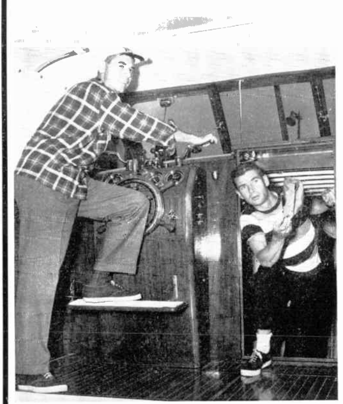
WHITTEMORE & LOWE'S Chris Craft has a flying bridge, Last year they were caught in storm on way to Nantucket. This year they plan to install a radio-telephone in their boat.