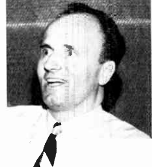
KIRSTEN FLAGSTAD, SET SVANHOLM