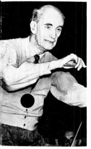
WILHELM FURT-WÄNGLER conducts the Vienna Philharmonic Orchestra in 5 albums in new release.