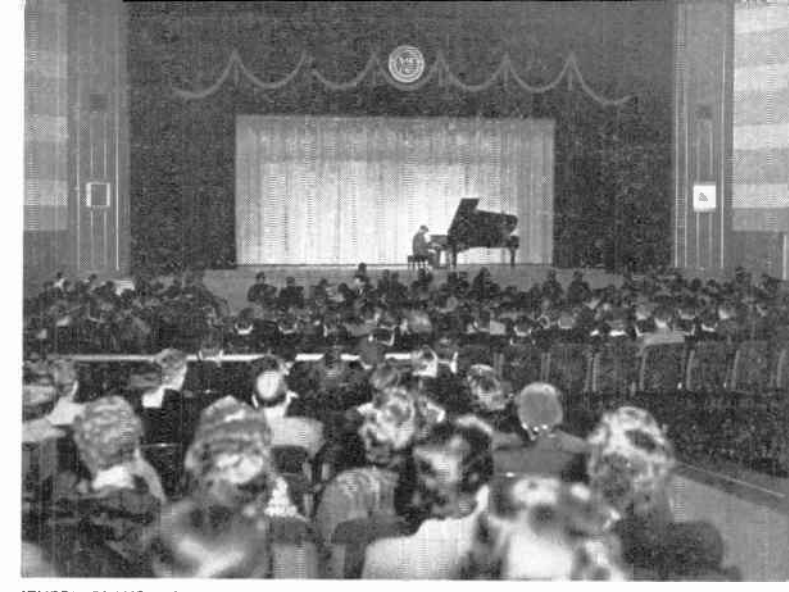
ITURBI PLAYS FOR VETERANS AT ST. ALBANS HOSPITAL IN N. Y.