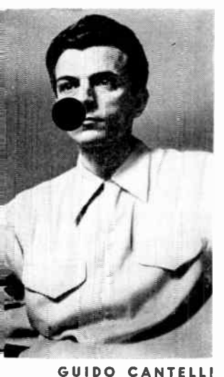
conducts the La Scala Orchestra of Milan, Italy, in Tchaikovsky's "Fifth Symphony."