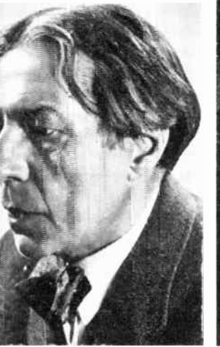
ALFRED CORTOT is heard in Debussy "Preludes (Book 1)" and Schumann's "Kinderscenen, Op. 15." Both works are coupled on 33<sup>1</sup>/<sub>3</sub> and 45 rpm speeds.