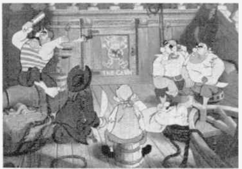
PIRATES AND INDIANS people Neverland. The pirates capture Indian princess Tiger Lily (daughter of the chief shown above) and try to make her reveal Peter Pan's hiding place.