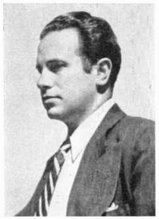
ANTAL DORATI, who has conducted several American orchestras, leads the London Philharmonic in a performance of Rimsky-Korsakoff's "Scheherazade."