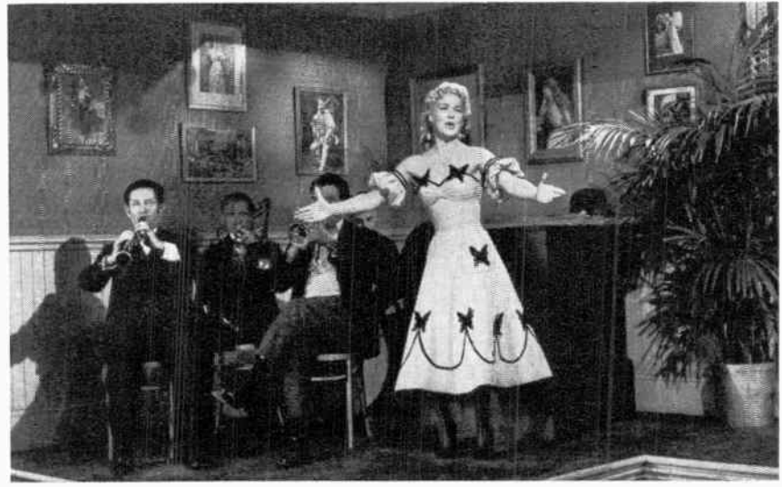
BETTY HUTTON, AS BLOSSOM SEALEY, SINGS IN A SAN FRANCISCO SALOON