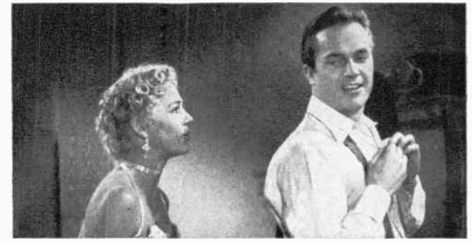
BENNY and Blossom marry and Benny becomes known as "Mr. Blossom Seeley" in the trade. This irritates him and when Blossom must go to White Sulphur Springs for a rest Benny stays on in New York and attempts to score a hit on his own.