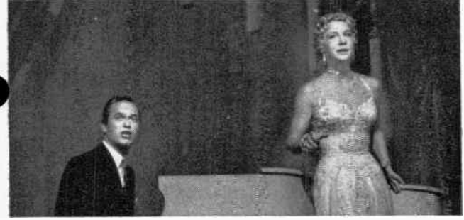
BLOSSOM (Betty Hutton) meets Benny Fields (Ralph Meeker) when he is hired as one of a trio to back up Blossom in vaudeville. She likes him, lifts him out of the trio and puts him in a duet number with herself. The act turns out successfully.