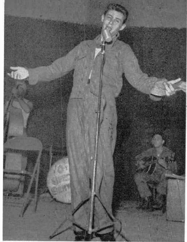
EDDIE FISHER ENTERTAINS TROOPS AT A KOREAN AIR BASE

was a river on our right. Later that day we were told to evacuate, being completely surrounded by ever-rising water. All we took with us was what we could carry, since we had to wade through water that was now neck high.