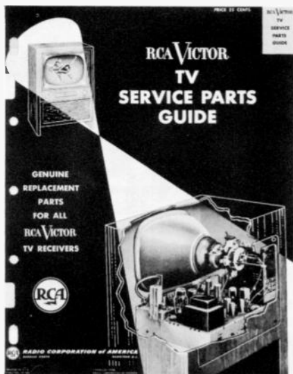
RCA Victor TV Service Parts Guide (Form No. SP-2001) lists the major replacement Service Parts for all the 249 RCA Victor receivers produced to date.

Not enough radio and television service technicians are capitalizing on the fact that the average set owner is already "conditioned." He will believe you when you tell him