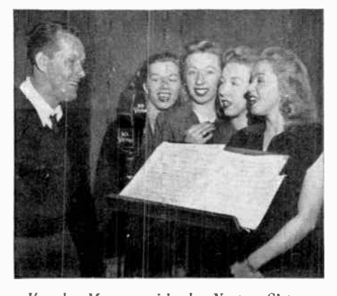
Vaughn Monroe with the Norton Sisters

P-160 List Price $3.15 I'LL SEE YOU IN MY DREAMS (with the Norton Sisters) DRIFTING AND DREAMING MEET ME TONIGHT IN DREAMLAND (with the Moon Maids) MY ISLE OF GOLDEN DREAMS DID YOU EVER SEE A DREAM WALKING I'VE GOT A POCKET FULL OF DREAMS (with the Moon Maids) DREAMS (with the Moon Maids) MY DREAMS ARE GETTING BETTER ALL THE