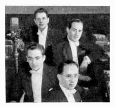
HEAR THE FIRST PIANO QUARTET in their own brilliant arrangements