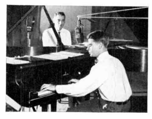
▲ Suggested list price exclusive of excise tax,