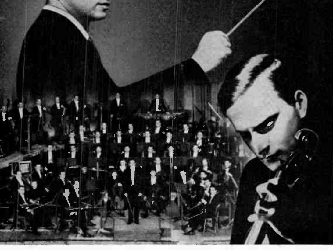
Stars of a prize-winning album — the Bartók Violin Concerto (see Page 2): Yehudi Menuhin with Antal Dorati and the Dallas Sym. Orch.