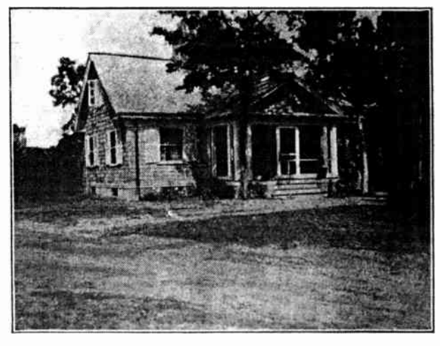
STAFF COTTAGE, MARION

Rochester, Mass., June 12 .- The Rochester town team fearing defeat at the hands of the nine representing the Radio Corporation of Amrica, at Marion, imported for the occasion a team made up of the fastest aggregation of baseball players ever possible to assemble on the diamond, and as a result came near losing. The wireless birds from the