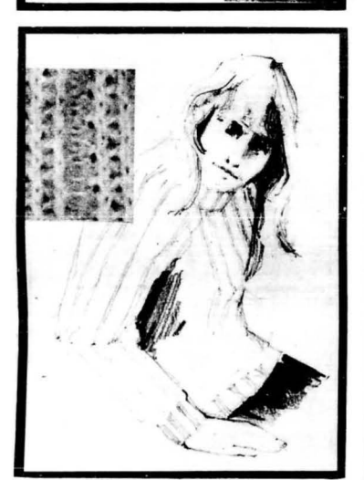
The garments illustrated are samples of the PORATT range

SHE has stolen this soft-fibred, natural jumper from