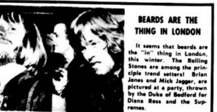
BEARDS ARE THE THING IN LONDON. It seems that beards are the "in" thing in London, this winter. The Rolling Stones are among the principle trend setters. Brian Auger and Mick Jagger are pictured at a party, thrown by the Duke of Bedford for Diana Ross and the Supremes.