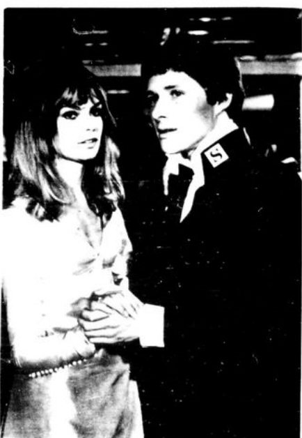
PAUL JONES STARS WITH MODEL JEAN SHRIMPTON IN THE FILM PRIVILEGE. Paul plays the role of Stephen Shor, a basically average normally confused young man, who allows himself to be led without understanding where or why.

By this stage Steven's image of religious worth has already reached top status. He is now a symbol of religious significance. He is now a symbol of religious significance.