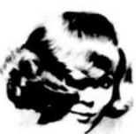
• The "shorties" look, the latest rage all over the world

Send your entry to "ELECT", GoSet, 2 Charnwood Crescent, St. Kilda.