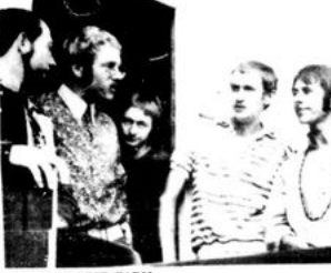
THE RABBIT FARM