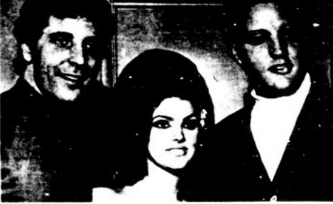
When Elvis went to see Tom Jones in Las Vegas, at the Flamingo Hotel, Elvis wore a Carnaby Street-style jacket. For their backstage meeting after the show, Tom had changed from his stage suit into a brown polka-dotted jacket and slacks.