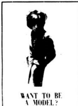
WANT TO BE A MODEL?