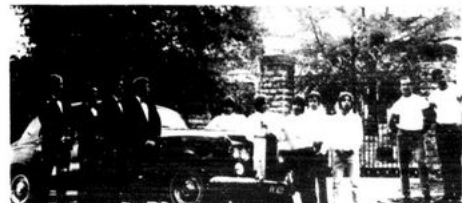
• The lucky group, with the lovely car and staff.