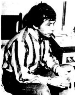
• ERIC BURDON

Well, what can I say? It's great and a real groove of an album. Anybody who digs the Animals will buy this for sure. The tracks on the LP include "When I Was Young", "A Girl Named Sandor", "See, See, Riders", "Don't Bring Me Down", "Help Me Girl", and "Hey Gyp". Eric Burdon has the sort of music I never get tired of. He's not quite as original as, say the Beatles. But the sound he and his group kick out is always exciting and always different, they never fail to make the charts. Burdon himself puts a song over better than the majority of pop singers today. His voice rises and falls, softens and becomes hard depending on the mood of the particular line he's singing. You can always feel what he's getting at. One of the three albums you must get. The other two are "The Most of the Animals" and "Winds of Change".