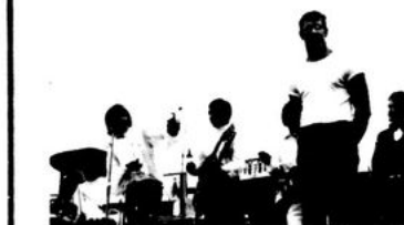
• As for the special party for their admirers, the group threw an impromptu concert, under heavy guard, of course.

To celebrate their good fortune, the boys threw a small private picnic for their fan club. Go-Set was invited, and we took these pictures, of the elegant incident.