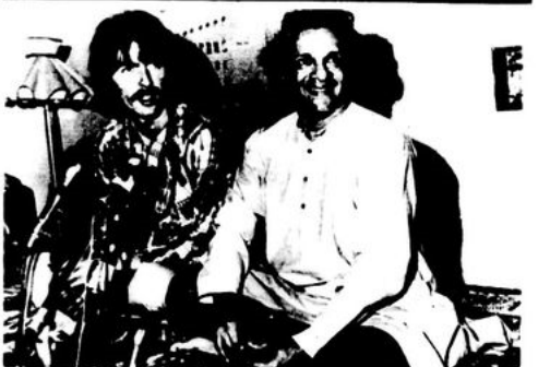
The Beatles may have lost interest in transcendental meditation, but George for one has not forsaken Indian music. Here he meets the Press with Indian