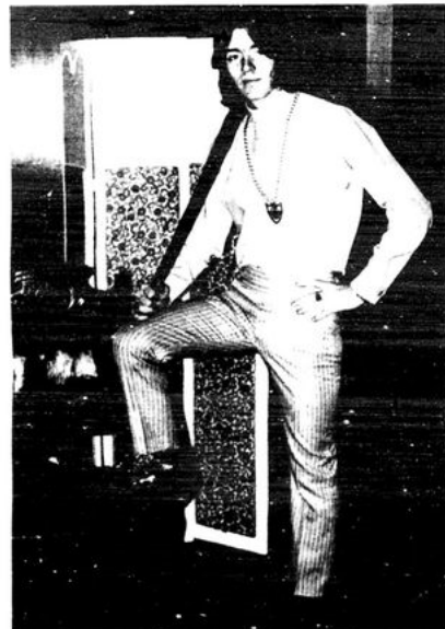
No. 3 Slacks by Frieze, featuring peaked waistband and tab back. Roll-necked shirt by Hosma. Two-tone shoes from France with clump heel.