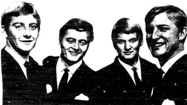
THE MAGNIFICENT MALES