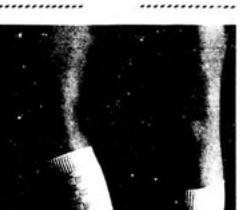
Lovely, Lovely HOLEPROOF