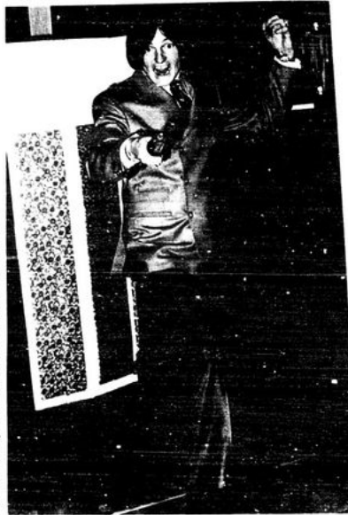
No. 2 Flared slacks by Leisure Fit. Shirt by Mr. B. Six buttoned D.B. Jacket by Frieze. Shoes by France.