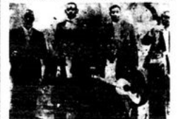
The man who started it all in 1896, Buddy Bolden, that's him with the cornet.

An event that now rivals the Newport Jazz Festival in America is the New Orleans Jazz Festival. New Orleans which at first decried jazz, has for the last 20 years increasingly sought to maintain its image of the city that gave birth to jazz, but one suspects more from tourist attraction reasons than for love of the music.