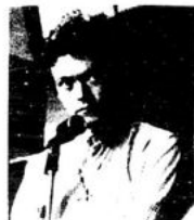
● Paddy... Twilights

What is happening to Australian pop? Are the top groups wavering on the brink of collapse? The Twilights, The Masters Apprentices and Somebody's Image — rumours are suddenly rife that these top groups are in trouble!