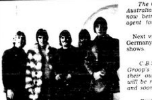
THE GROOP in London