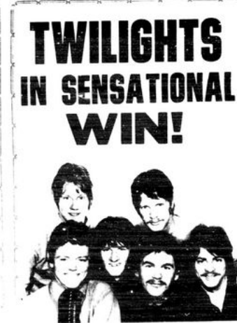
TWILIGHTS IN SENSATIONAL WIN!