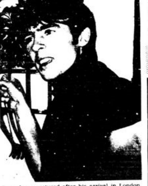
Davy Jones pictured after his arrival in London.

Davy Jones flew into London last week for two weeks of TV interviews and business discussions. He told the English Press: "The Monkees will be going on the road in July. We plan to visit Hawaii, South America, Japan, Australia, New Zealand, Holland, Germany and Sweden as well as Britain".