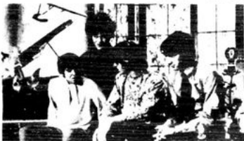
MONKEES — NOT SO STRONG