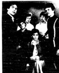
TWILIGHTS — BY A WHISKER