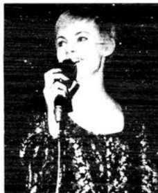
BEV — FROM SECOND TO FIRST