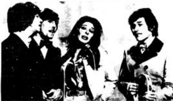
U.S. singer Bobbie Gentry last week tele-recorded the first of six ballroom TV shows for English release. Here Bobbie is joined by three of the Hollies who were guests on one of her shows. Tony Hicks, Graham Nash and Alan Clarke.