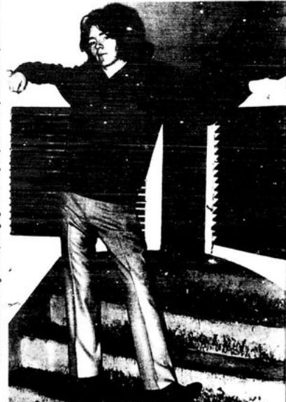
No. 4 Flared slacks by Leisure Fit in camel. Roll-necked shirt by Hosma. Eight-buttoned suede knit jacket, double breasted, from Yugoslavia.

With the accent on elegance and just the hint of the 1880's the brand new appeal is pleasing and attractive. Trousers are gently flared from the knee, jackets, in both single and double breasted, styling shows a profusion of buttons, 4-6 and 8. Shirts introduce a Spanish theme both in colour and style. Shoes feature a heavier but more stylish look, but more important is the introduction of the Vintage tones, ranging from Bergandy and sherry brown, to pink and deep purple, which blend in stylishly to create an effective TOTAL LOOK. Modelled by Peter and Jim Masters Apprentices