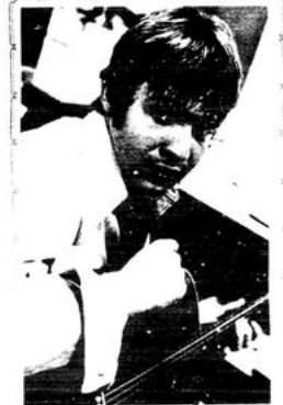
TOP AUSTRALIAN MALE NORMIE