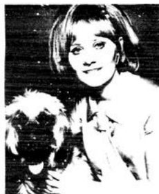
LULU — INTO TOP SLOT