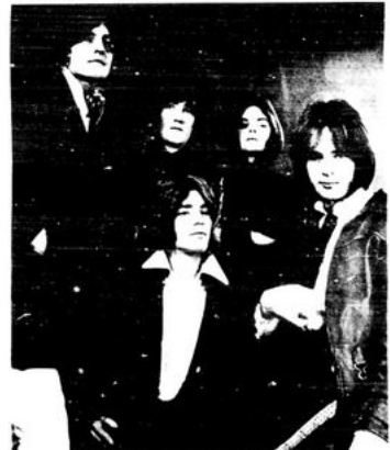
MASTERS — ALMOST EQUAL TOP!