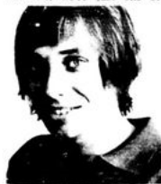
● Russel... Somebody's Image

Doesn't it matter who's in the group? Do kids just like the name? "I don't think it matters how many changes we have, we're just one of