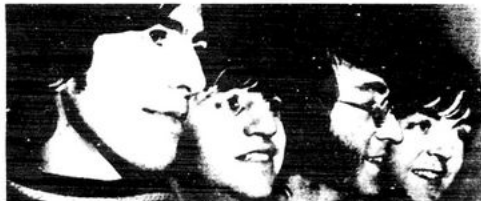
BEATLES — THREE YEARS RUNNING