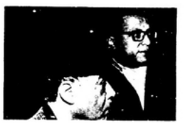
DUKE ELLINGTON with the late Billy Strayhorn — Ellington's associate composer-arranger who died last May. A memorial album. And his Mother called him Bill! It is to be released soon.

A return to a smaller group for Duke but what marvellous players all together.