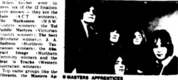
WINNERS OF THE HOADLEY'S BATTLE

Groups will be there to guarantee the former, and final, but winners names of the Hoadley's Battle were not available in time for the press. The groups will be on in Melbourne and Adelaide for this issue.