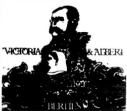
VICTORIA & ALBERT BERLIN