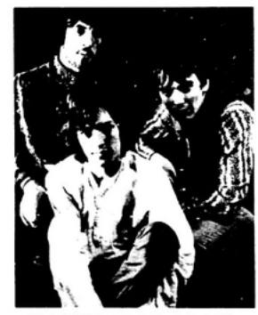
THE TRAFFIC — Chris Wood, Stevie Winwood and Jim Capaldi.