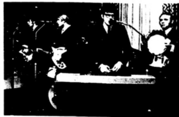
Full marks to Ramrod Records for taking the Motivation under its wing.

During their three years' name groups, their first on the Sydney scene the record "Motivation" has worked like a good first step with an number of top-downs chart success.