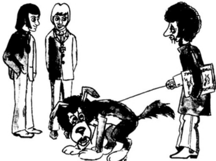
The whole family really goes for that Jimi Hendrix guy! (1. Winner of 230 Byng Street, Cheltenham, N.S.W., will be receiving an L.P. for his efforts. (Start very soon.)

We're still receiving hundreds of entries in our Cartoon Competition, but there is room for lots more. Remember we're giving away a $500.00 prize contract to the best cartoonist.