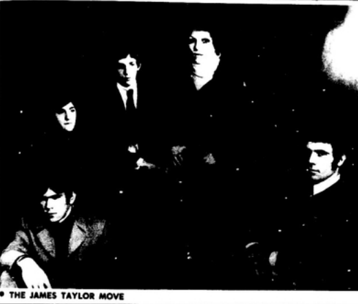
THE JAMES TAYLOR MOVE