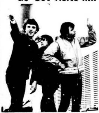
M.P.D. ON THE 'ACHILLE LAURO' LINER

"Lovesick," Adelaide If he hasn't already got a girlfriend you should make some attempt to interest him, too out of your way in "accidentally" meet him as often as possible. Be friendly and subtly let him know you like him. After all you have nothing to lose. If he doesn't respond or already has a girlfriend, you can't do anything except look around for new friends and interests to take your mind off him.