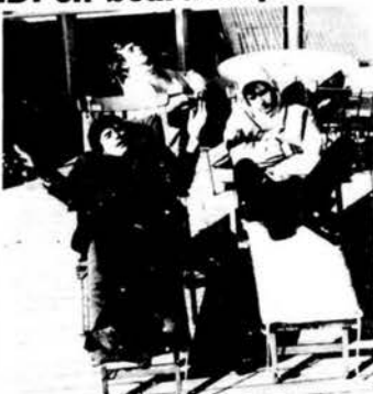
A TASTE OF THINGS TO COME