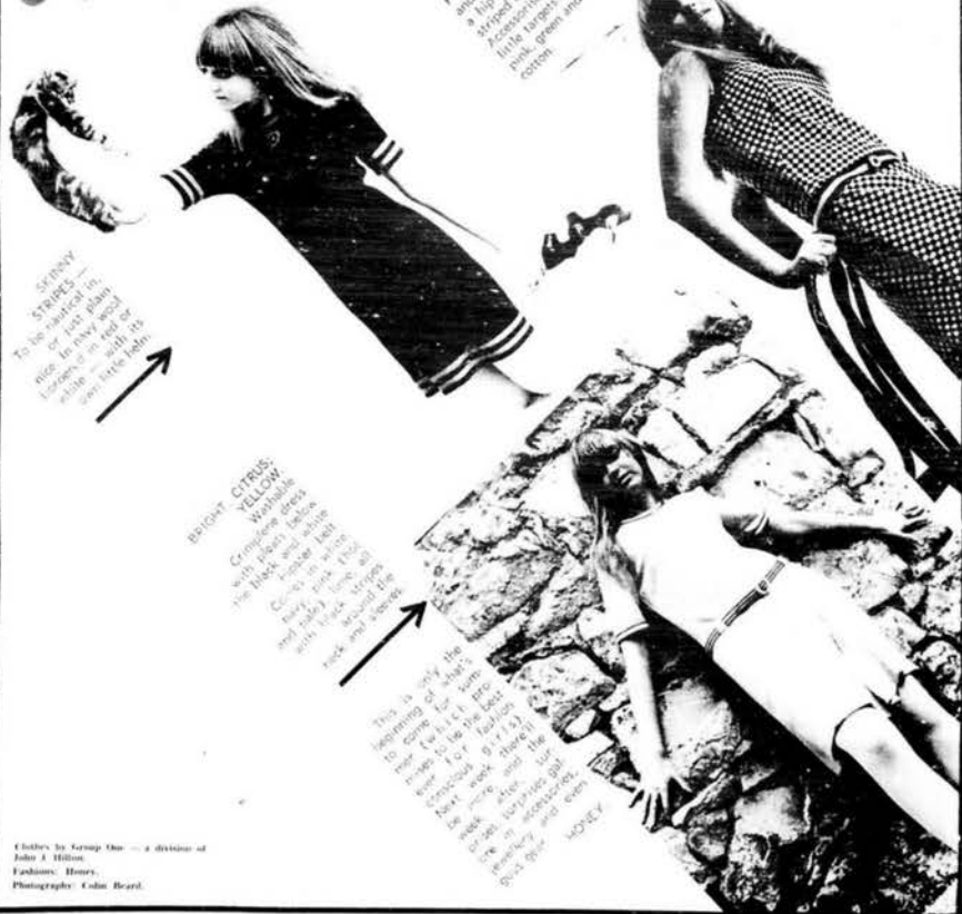
ZEBRA STRIPES—BLACK, WHITE, BOLD AND BRIGHT!

and a young girl's fancy turns to COLOR STRIPES BANG! POW! Golden knees... and birds and bees