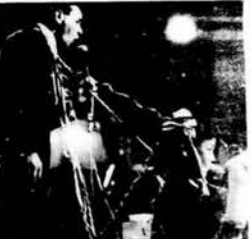
HOWARD MORRISON AND THE QUIN TIKIS