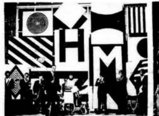
HOWARD MORRISON, KIRI AND THE QUIN TIKIS ON STAGE