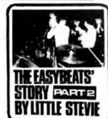
THE EAST BEATS STORY PART 2 BY LITTLE STEVIE