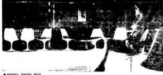
Sibylla's interior decor