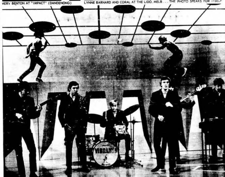
MELBAIDE'S VIBRANTS ON CAMERA — THEY ARE NOW TURNED PROFESSIONAL IN MELBOURNE