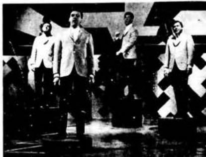
THE ALWAYS-POPULAR DELLTONES