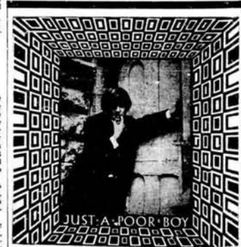
JUST A POOR BOY The photo on this L.P. cover is from Go-Set Vol. 1, No. 8 (March 23) — Winner of the competition will be announced next week.