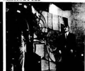
JA-AR... ON CAMERA