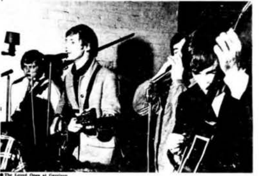
The Loved Ones at Enmore