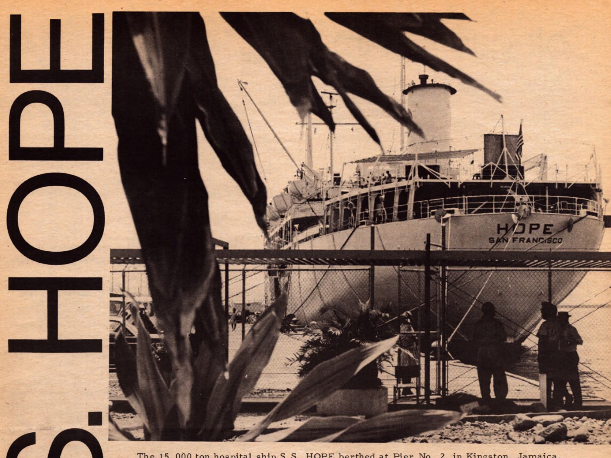
The 15,000 ton hospital ship S.S. HOPE berthed at Pier No. 2 in Kingston, Jamaica.