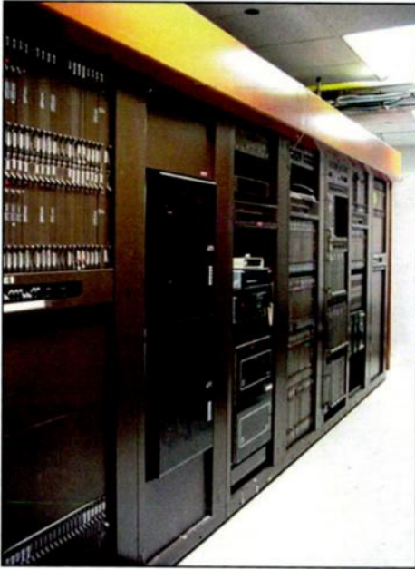
"State of the Art" Nortel DMS100 Switch circa 1979

Even though broadcasters have embraced ISDN, the market is niche and relatively small in comparison to other markets serviced by the major telcos. Much of the Central Office hardware for ISDN and POTS circuits, such as the 5ESS and DMS100 Central Office switch, is antiquated and parts are no longer manufactured, making repair or replacement difficult or impossible. Troubleshooting ISDN circuits is a difficult task and many experienced ISDN technicians have retired.