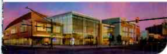
The Greater Columbus Convention Center

The SBE National Meeting includes the SBE National Awards Reception and Dinner, recognizing outstanding achievement by SBE members and chapters. The SBE will also conduct the SBE Annual Membership Meeting on Sept. 27. The SBE is working on streaming the meeting live so members not