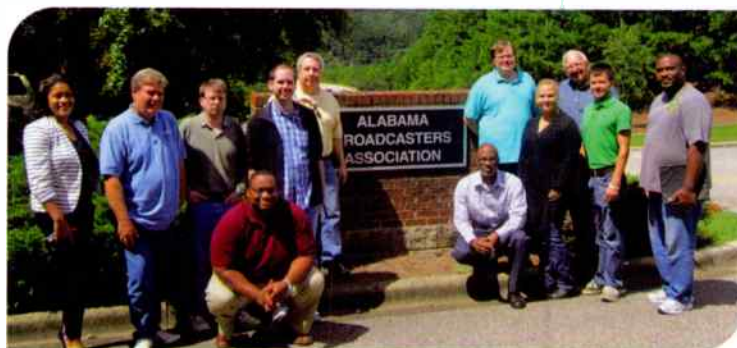
The ABA Engineering Academy class of 2022.

In cooperation with the SBE, the Academy offers the students the opportunity to take the SBE Certified Broadcast Technology (CBT) exam at the end of the week.