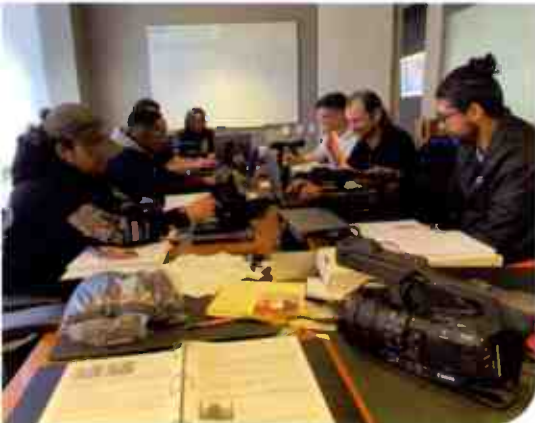
VETV students learn about cameras during part of the class.

If you or someone you know might fit in with our organization, might like to become a corporate sponsor, or may wish donate their time and expertise as a guest at one of our upcoming classes, please contact VETV at veterans-tv.org.