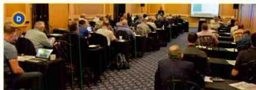
A The SBE booth was a hub of activity. | B The SBE Member Reception, held Monday evening, was a chance to socialize and relax. | C The SBE Ennes Workshop RF101 Boot Camp brought in more than 30 attendees. | D The SBE Ennes Workshop ATSC 3.0 NextGen Broadcast track had more than 60 attendees. Both Ennes Workshop tracks spanned two days.