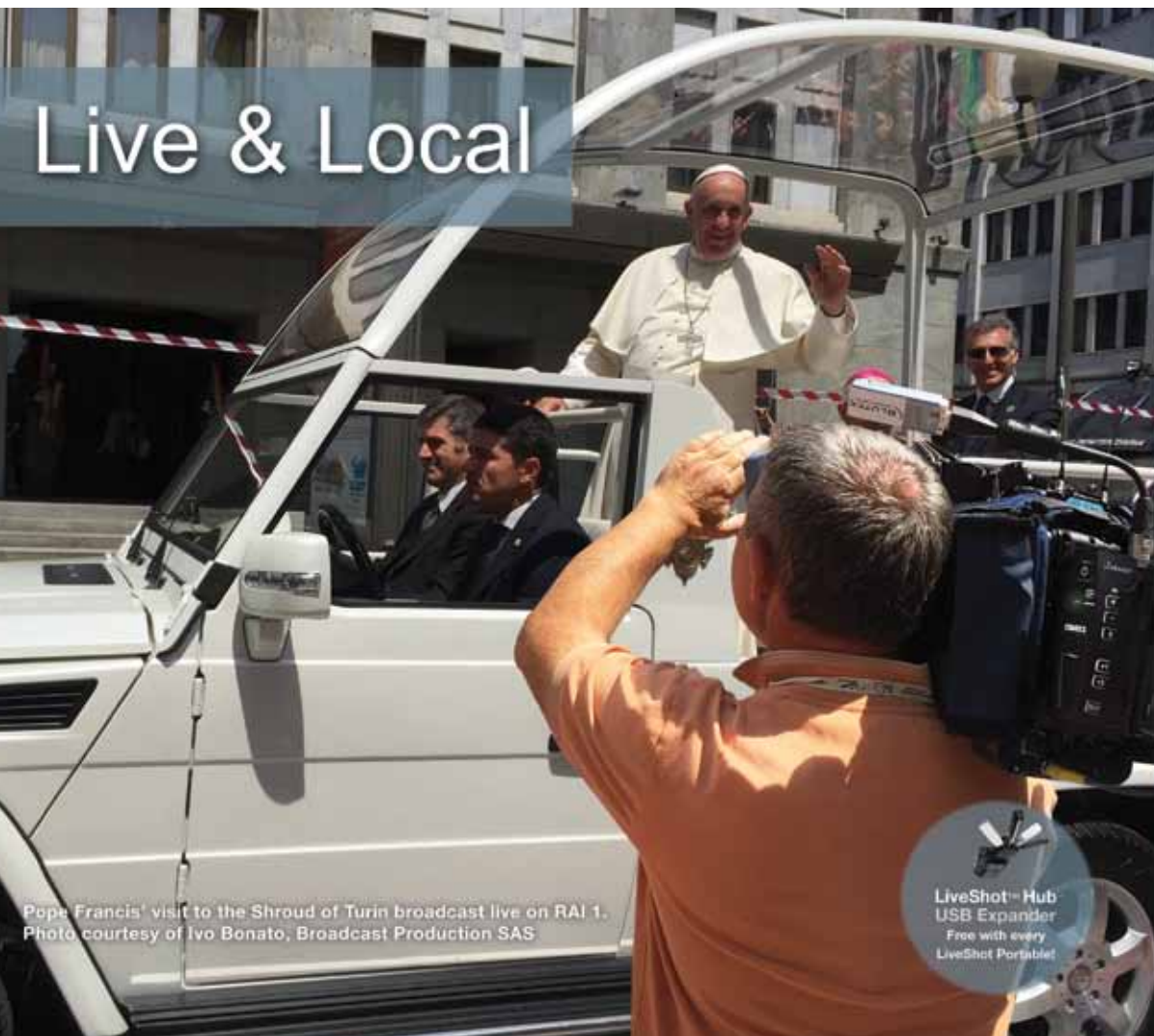
Pope Francis' visit to the Shroud of Turin broadcast live on RAI 1.