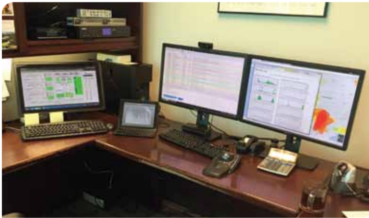
Document all passwords and port settings, but not on a Post-it in plain view.

Avoid putting any equipment or part of the network directly on the Internet without some sort of firewall protection in front. Ideally, any data link from the studio to a remote location, such as a transmitter site would use a private link using a dedicated wireless or wired data link but more often it's easier and less expensive to install