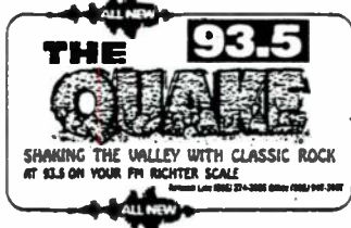
CA Rosamond KLKX 93.5 The Quake