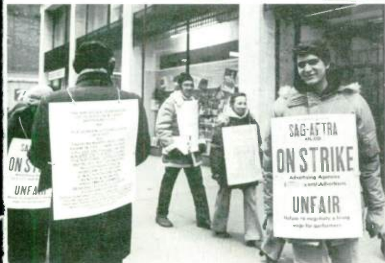
Getting the facts out to the public.