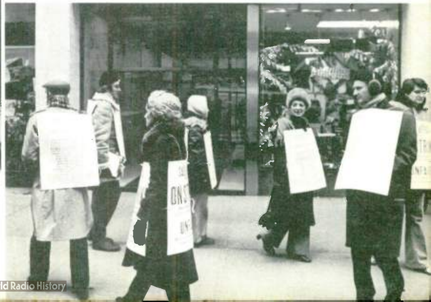
Another day, another site.