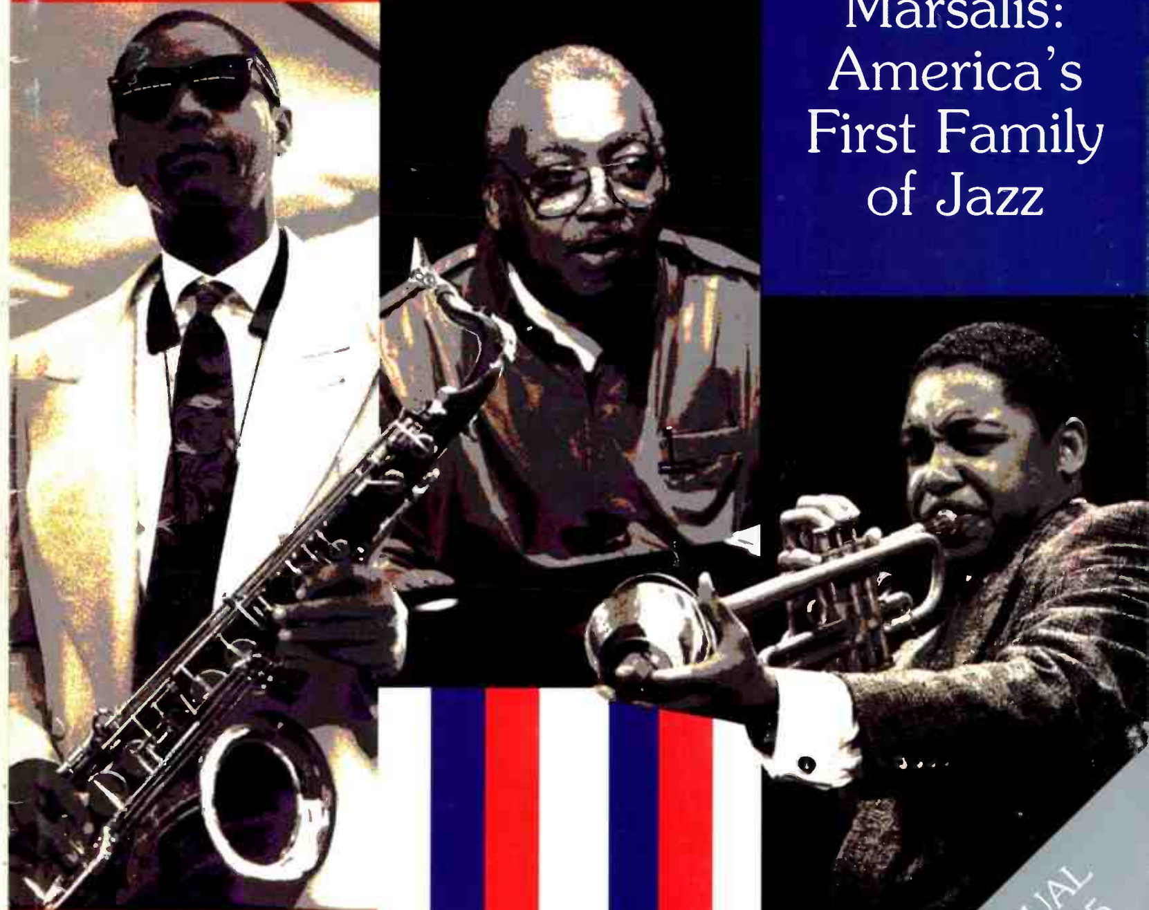
(l-r) Branford, Ellis and Wynton Marsalis

Marsalis: America's First Family of Jazz