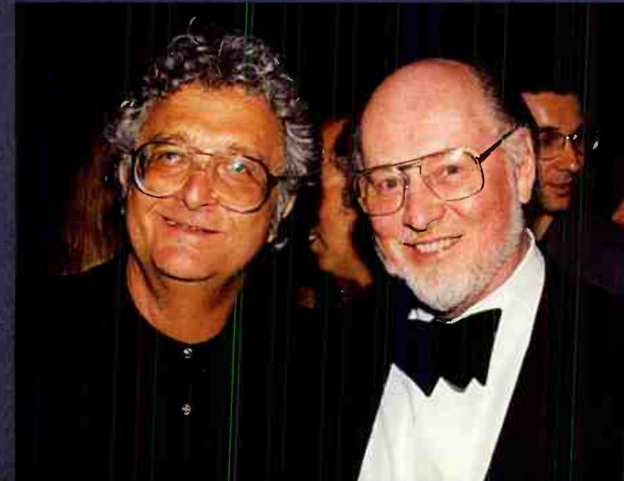
TWO OVER-ACHIEVERS: Randy Newman (left) is pictured with venerable composer John Williams, who was a special guest at the awards.