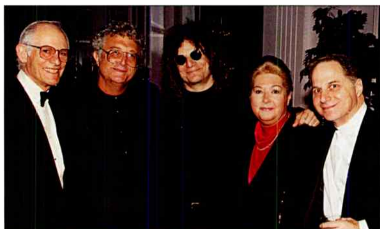
MAINTAINING COMPOSURE: Pictured at ASCAP's 1996 Film and TV celebration are (l-r) Alan Bergman; Henry Mancini Award recipient Randy Newman; Don Was, honored for his theme to "Mad About You"; Marilyn Bergman and DreamWorks Records' Lenny Waronker, who is a boyhood friend of Newman's and has produced several of his albums.