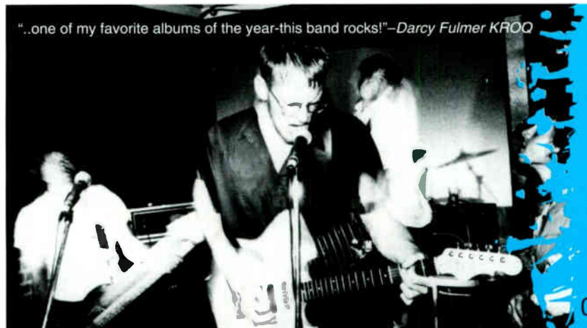
"...one of my favorite albums of the year-this band rocks!"—Darcy Fulmer KROQ

Airpower awarded to those records which attain 400 detections for the first time. New airplay lists those stations registering six or more detections per week on a record for the first time. ★ Initial impact: records registering 100 or more total detections for the first time.