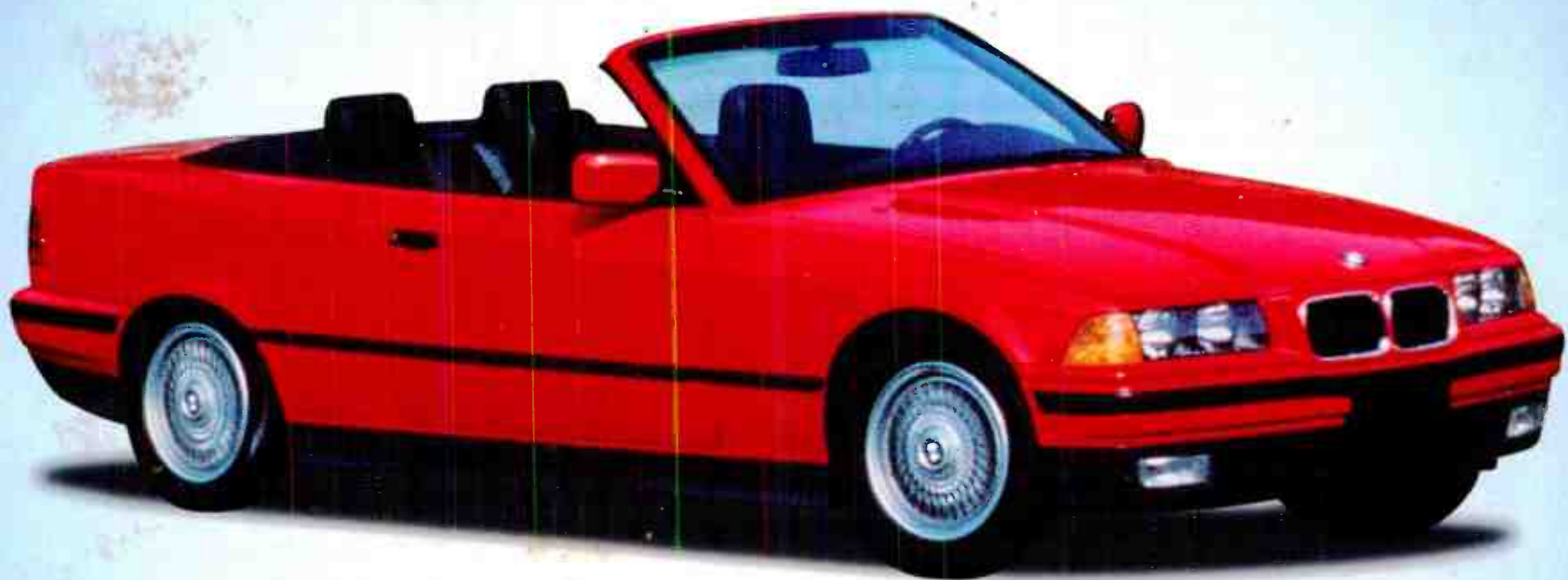
Grand Prize BMW 318i Convertible