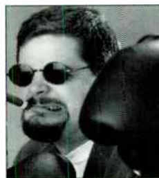
Mancow Muller Air Personality WRCX Chicago

Muller's pre-radio career includes pitstops as a