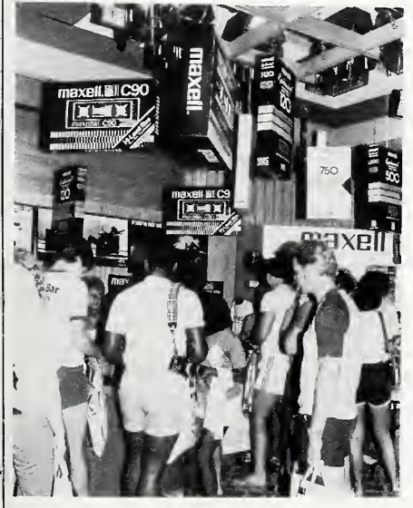
MAXIMAL MAXELL — The Maxell booth was a popular stop for Record Bar store managers during Vendor Day at the chain's recent Summer Summit at Hilton Head Island, S.C. Thirty-three vendors participated in the event.

This view was shared by some of the stations themselves. "KQAK's signal is only 4300 watts and they are barely audible in East Concord (a city east of San Fran-