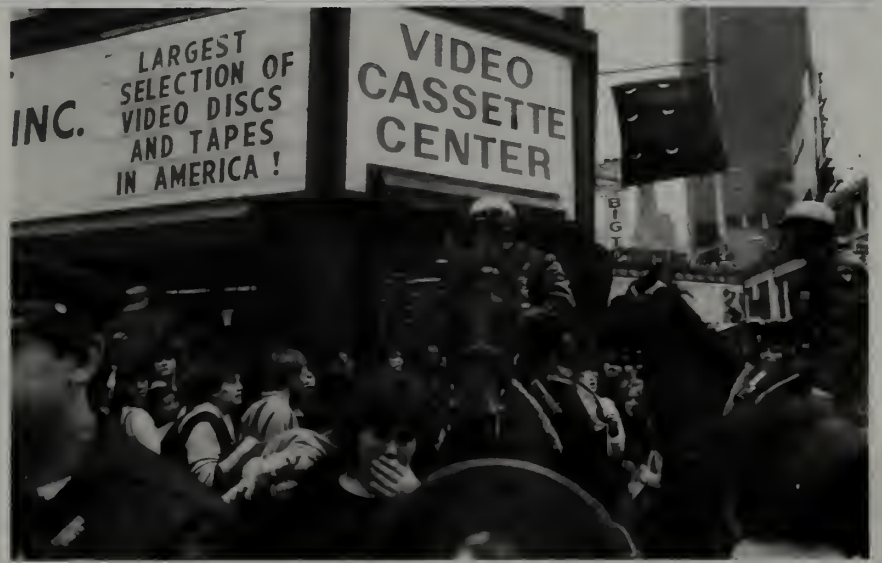
NERVOUS MOMENTS - Police horses and a swarm of Duran Duran fans were frightened of each other as officers tried to clear the sidewalks at Video Shack's 49th & Broadway Manhattan location. Over 150 policemen were on hand to quell a brief period of disorder caused by Duran Duran's in-store appearance in support of their new Video 45. (see story, page 12).