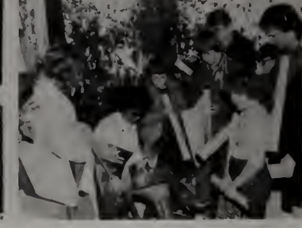
PROMO TREK — Members of the U.S.S. Enterprise mingled with enthusiastic video game players during a recent promotion tour for Sega Electronics, Inc.'s latest video game, a space adventure amusement based on the popular Star Trek TV and movie series. Pictured here at different locations along the tour route are (I-r): George Takei, who portrays Commander Sulu in the Star Trek