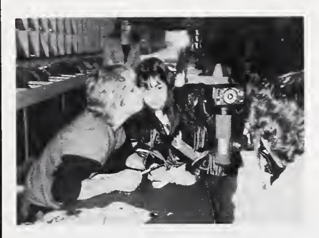
OZZY'S IN STORE - Ozzy Osbourne hams it up at a recent in-store appearance at Strawberries Records and Tapes in Providence, Rhode Island.

IN-STORE APPEARANCES MAKE SENSE NOT CENTS — It was a warm Friday evening on Hollywood's Sunset Strip. Tower Record's parking lot was even more crowded than usual and the sight of the Sheriff's Department's patrol cars signified a major event. Around 500 people had arrived by 5 pm to meet the band Menudo during its scheduled 5 pm to 7 pm appearance at the Tower outlet. It was 5:15, the crowd had almost doubled in size, and the band was still not there. By 5:30 when the band had arrived the crowd had grown to approximately 1,200 and the Sheriff's Department was beginning to worry. Business at the store was suspended while the band took its place and began receiving the first of the near frantic fans who were anxiously waiting at the back door. According to store manager