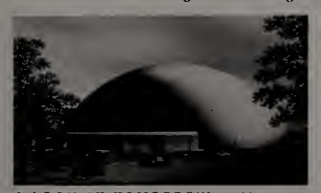
A LOOK AT TOMORROW - Houston, Texas will soon offer the world's largest motion picture sound stage, shown here in an artists' rendition. Designed by Aeschbacher Chambers Architects and built by Temcor, the domed facility is scheduled for completion in early 1986.

The first phase of the immense project, involving approximately a $30 million investment, will see the construction of the world's largest aluminum clear span dome, 135 feet in height and 430 feet in base diameter. The floor area will entail about 3.2 acres and will thus supplant in size the renowned "007" soundstage at Pinewood Studios in England. The stage