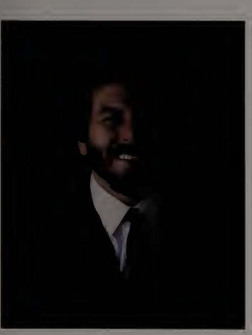
Nolan Bushnell The founder of Bally Sente.

Buying complete games has always meant taking incredible risks for questionable returns. What a nerve-racking business! It's probably caused the life expectancy of the average video game operator to drop as quickly as that of the average video game.