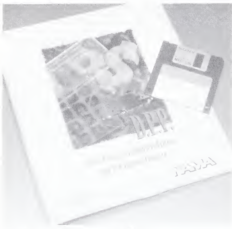
NAMA's DPP Model for Vending Machines

CHICAGO —Figuring out exactly which products in a vending machine make the most profit for vending operators has long been a problem without solution. Those in the vending industry have struggled for years to determine the cost implications of their marketing, operational and merchandising decisions.