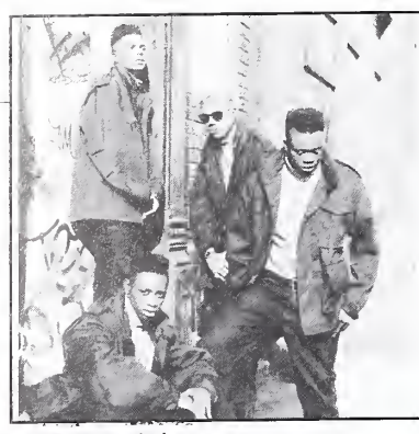
#1 SINGLE: Jodeci