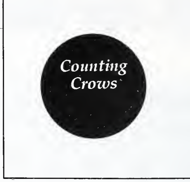
HIGH DEBUT: Counting Crows