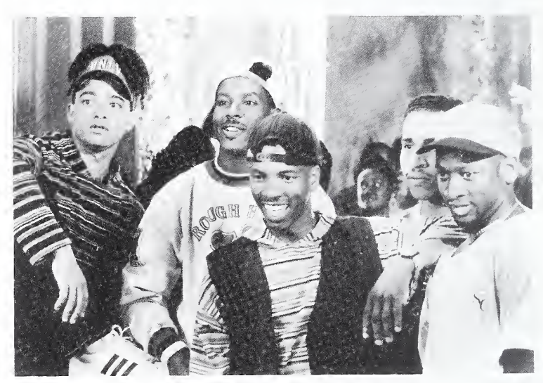
The arrival of a sultry stripper has members of the cast of House Party 3 ready to drool.

THE FORMULA OF THIS SUCCESSFUL hip hop-driven feature film series is by now well-known. It's all about a party. The only thing that seems to change significantly is the interpretation of the House Party originally envisioned by creators Reggie and Warrington Hudlin, who bailed on the New Line Cinema series after the initial installment. But it's hard to resist a Party, or so New Line Cinema hopes.