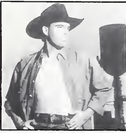
#1 SINGLE: Clay Walker