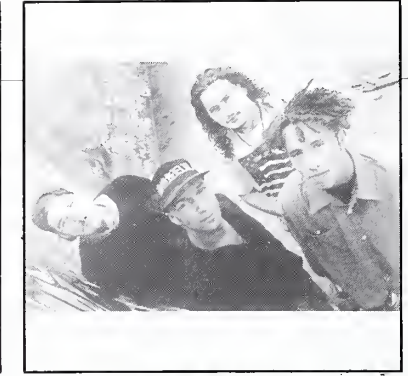
TO WATCH: Rage Against the Machine