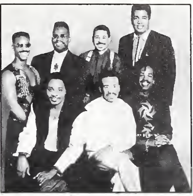
TO WATCH: Earth, Wind & Fire