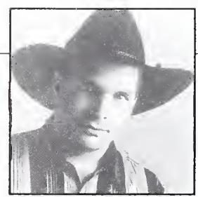
TO WATCH: Garth Brooks