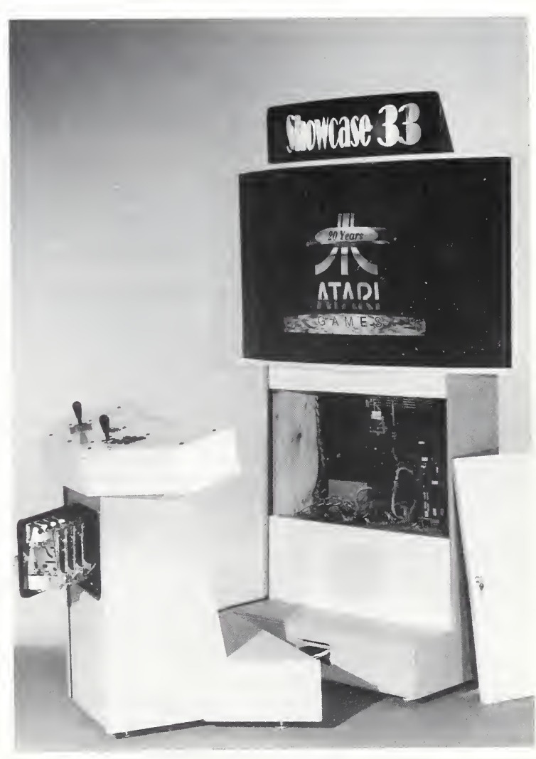
Atari's "Showcase 33"

Further information may be obtained through Atari distributors or by contacting Atari Games, 675 Sycamore Drive, P.O. Box 361110, Milpitas, CA 95035 for referral.