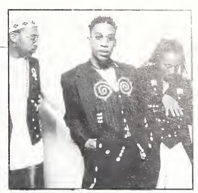
HIGH DEBUT: Tony, Toni, Tone