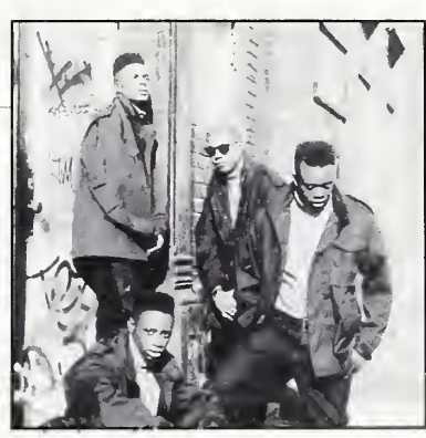
#1 SINGLE: Jodeci