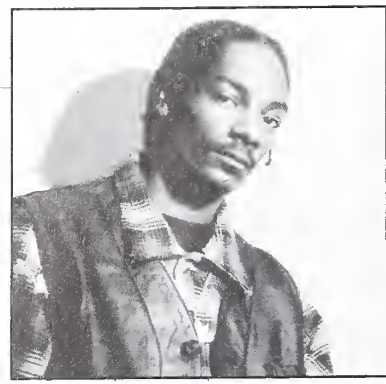
#1 ALBUM: Snoop Doggy Dog