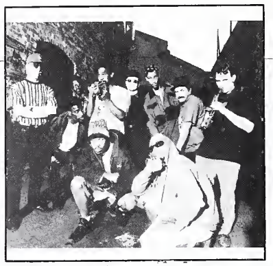
TO WATCH: Us 3

WILL YOU BE THERE (IN THE MORNING) (Capital 58041) . . . . Heart DEBUT