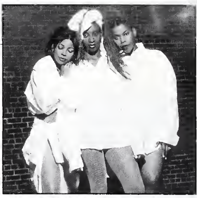
HIGH DEBUT: Brownstone