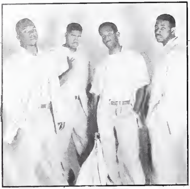
#1 SINGLE: Boyz II Men