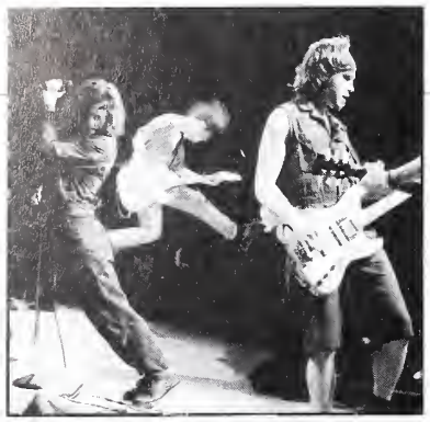
#1 ALBUM: Pearl Jam

18 FIELDS OF GOLD-BEST OF STING 1984-1994