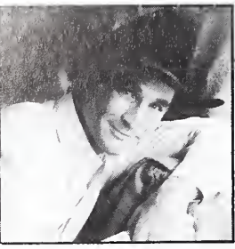
#1 SINGLE: Clint Black