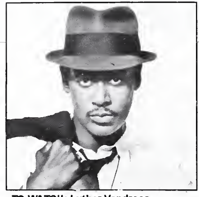
TO WATCH: Luther Vandross