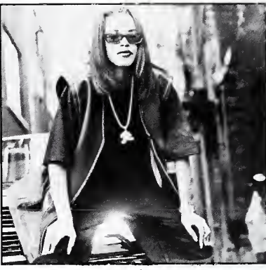
HIGH DEBUT: Aaliyah