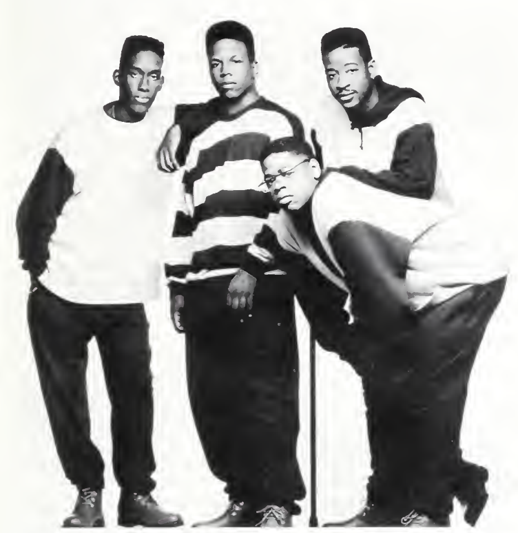
Boyz II Men garnered four AMA nominations

Nominations for the AMAs are in seven categories. In the Pop/Rock, Country and Soul/Rhythm & Blues categories, awards will be presented for Favorite Male and Female Artist, Favorite Group, Favorite Album and Single, and Favorite New Artist. In the Adult/Contemporary, Heavy Metal/Hard Rock, Rap/Hip-Hop and Alternative Music Categories, awards will be presented for Favorite Artist.