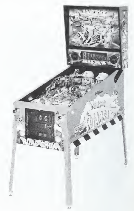
Williams' Road Show

Further information may be obtained through factory distributors or by contacting Williams Electronics Games, Inc., 3401 N. California Ave., Chicago, IL 60618.