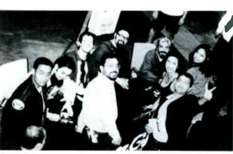
Café Tacuba signing post-concert autographs in front of Sam Goody's at Universal City Walk.

SEIZING THE POP LISTS: No need for the Freeman Men here. The quintet Los Tigres del Norte continues marking a new ear in the Latin music industry. Through the lyrics in their new song "El Circo" (The Circus), the popular group has expressed their sentiments about the economic