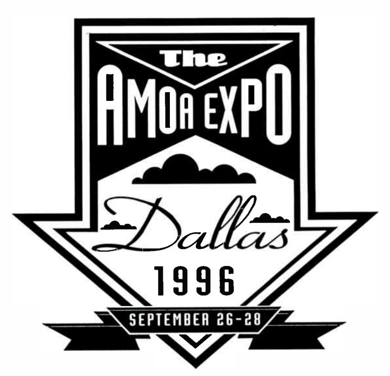
The Amusement & Music Operators Association's International Exhibition & Educational Seminar for the Amusement, Music, Entertainment & Vending Industry.

Booth space for this show will be sold through W.T. Glasgow, Inc. For further information contact Glasgow at 708-333-9292.