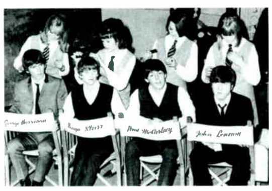
The Beatles preserved.

Then also gone are parts of ourselves. We're back to cave dwelling and having to rely on the passed-down memories of our elders to preserve history;