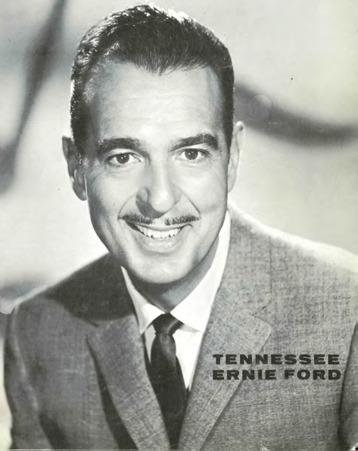
TENNESSEE ERNIE FORD