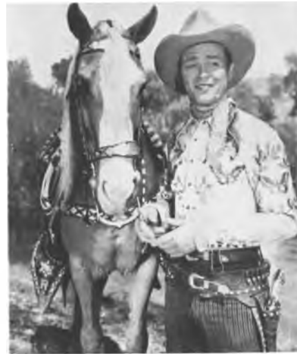
Roy Rogers in an early still with the late Trigger, his famous horse.