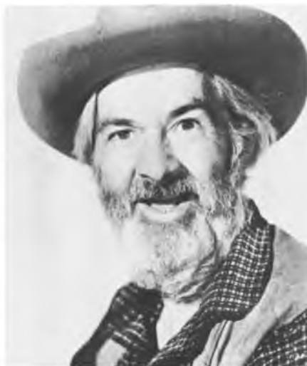
The late GABBY HAYES, for years a comedy sidekick with Rogers in the movies.