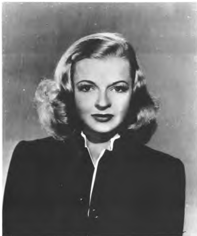
Dale Evans, Texas Beauty.

books have sold at the rate of 25 million annually. Success has been so good for America's No. 1 rodeo team that Roy can afford $10,000 a year for Western attire. It is obvious that Roy possesses highly developed business acumen.