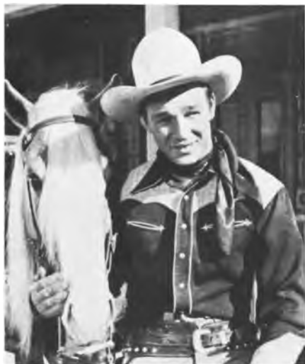
Roy Rogers & the late Trigger, his horse.