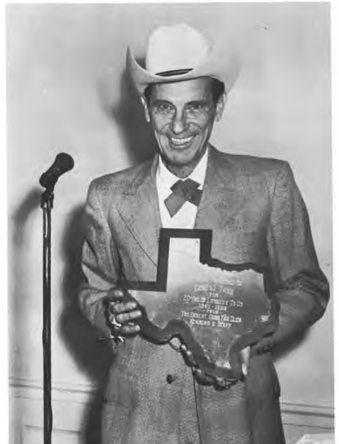
Ernest Tubb displaying plaque from his fan club.