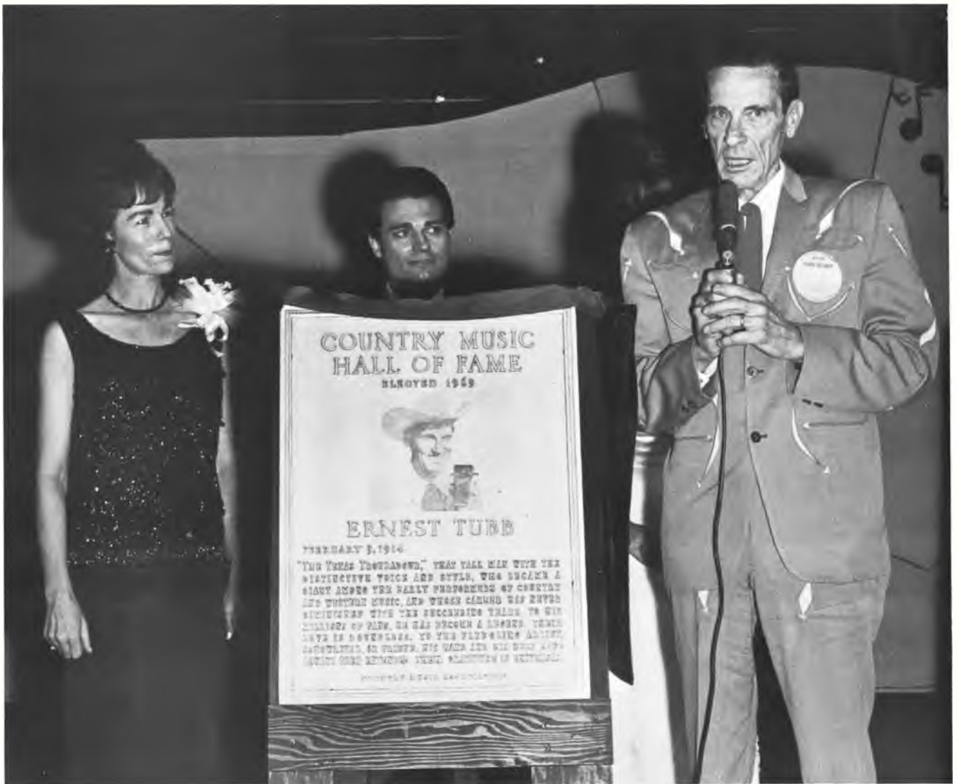
A humble and tearful Ernest Tubb accepts his election to the CMA Hall of Fame October 1965.

Even after all this time, I am still amazed at his thoughtfulness and generosity. As I said, you can't out-give Ernest Tubb. I don't see how he makes any money at all—he gives away so many records, free passes, tips, etc. Recently a fan wrote me that he had given her five of his Decca albums when she was visiting with him after a performance, but that her two favorite songs were not in any of these albums—so he had told her to write me to send her the other two albums. (I am kept supplied with available albums for DJ's who need them.) As her letter was pointedly specific in its instruction to send the records free and postpaid, I hesitated. Before long, a second letter arrived, roughly insisting that I owed her the albums because Ernest had promised them to her. I didn't mention the incident to him; he only would have said, "Well, go ahead and send them anyway. Maybe she will get some enjoyment out of them."