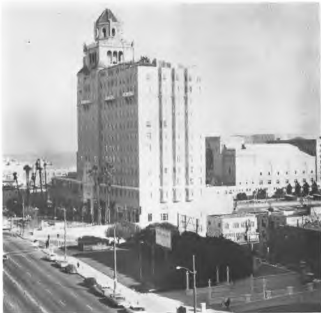
THE BREAKERS HOTEL