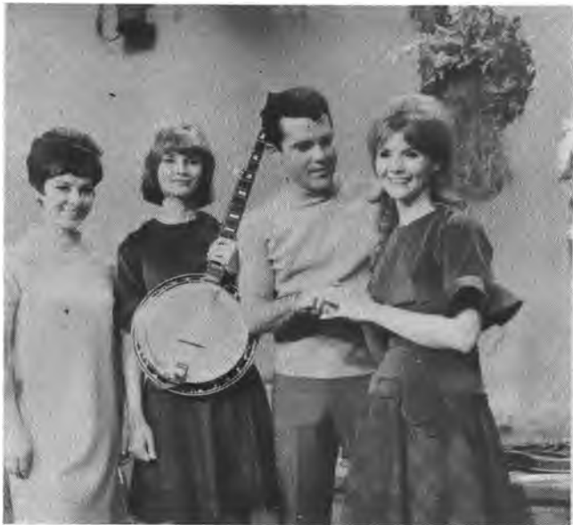
Gigi Perreau, Romie Stoneman, John Ashley and Donna Stoneman, make friends on the Stoneman syndicated TV Show, being filmed in the adjoining studio at WSIX, the same time as the Robbins family scene set was ready to roll the camera.