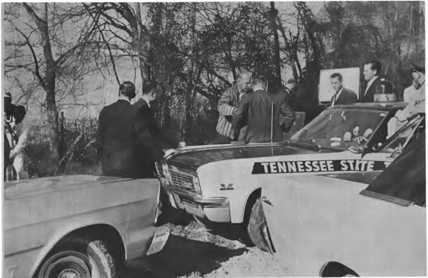
Cameraman, Treasury men and Highway patrolmen, line up in the woods, for direction in the moonshine scenes.