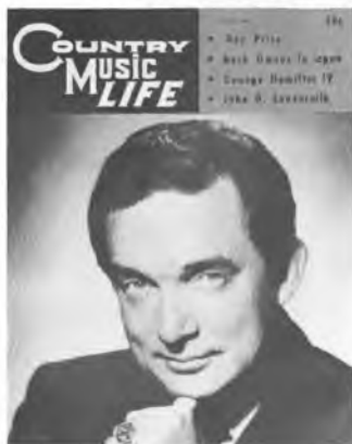
Ray Price, "The Cherokee Cowboy"! See story on page 24.

COUNTRY MUSIC LIFE is published monthly at Orange, California, P. O. Box 2366, El Modena Station, Orange, Calif. 92667 by Country Music Life Publications, telephone (714) 538-8875. Sold by subscription only. One year $5.00. Two years $9.00. Canada and overseas, $2.00 additional. Second class postage entered at Orange, California. Editorial content may not be reproduced in any form without written permission. Copyright 1967, Country Music Life Publications.