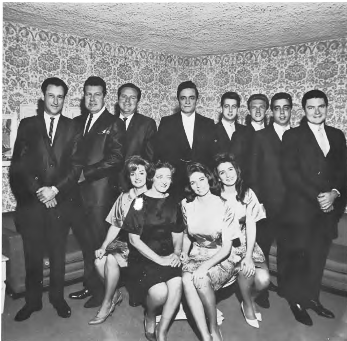
The Johnny Cash Show featuring The Tennessee Three, The Statler Brothers, and The Carter Family