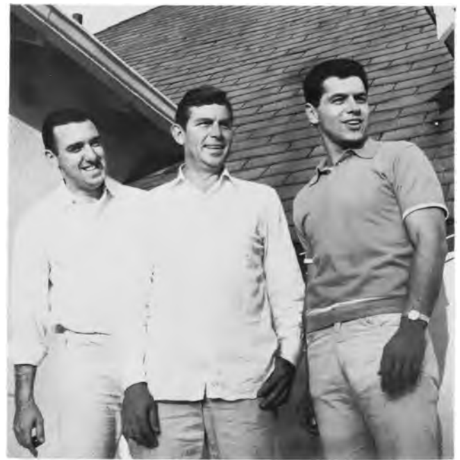
These three country boys have really come to town.

Days' and knows the value of every step he has taken in his lone climb in Hollywood." I'm no super star, but things continue to open up for me". That's a modest appraisal of a very successful career. A couple of new TV pilots could materialize any day. He averages four movies a year. He's a man on the move and likes it that way. When making a movie, he usually does his own stunt work, which is unusual. Though he's never been a "stuntman", he's very adept to any physical adjustment that comes up in sequences of shooting. This talent adds to his value as a movie actor and enhances the believability in the part he's playing. Believe me, that stunt work is no fun at all! Friend of mine has been one of the leading stuntmen in Hollywood for years, and he says "We earn every penny we make, and then some. Insurance is a problem for the man who does his stunts too, which is something else to consider. This young man, who turns thirty-one this month, enjoys the respect of those with whom he works. Just another example of his character, hard work and tremendous acting ability.