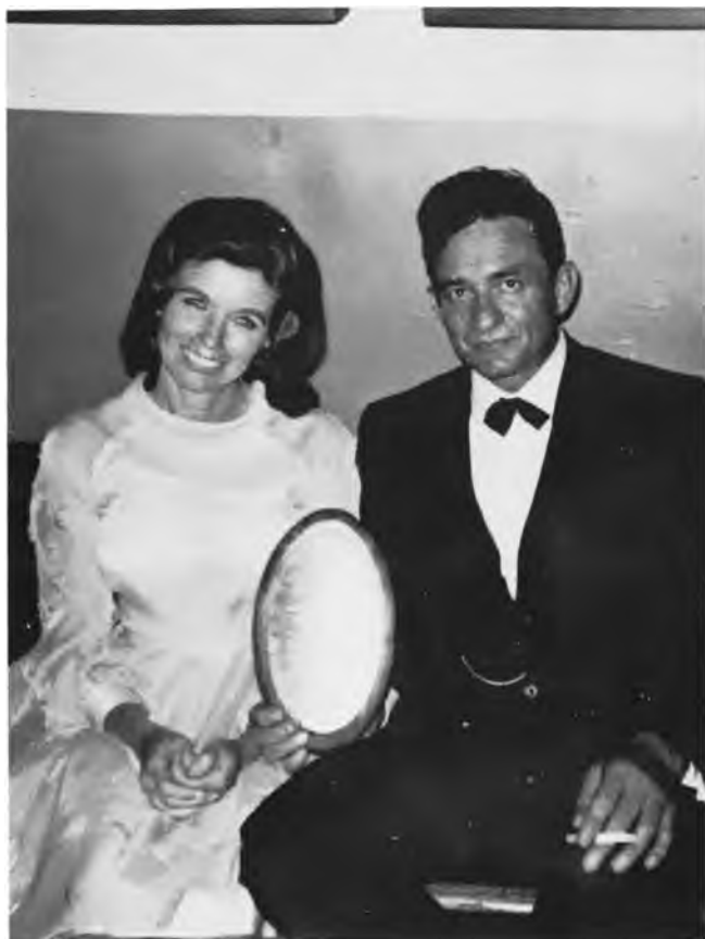
Johnny Cash and June Carter