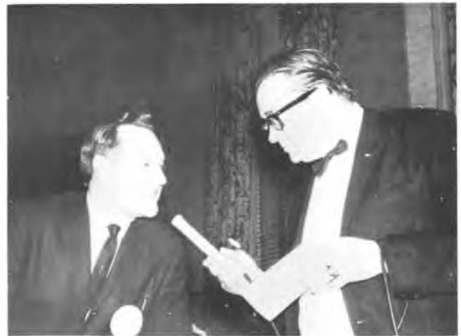
Kenny Roberts with Tex Ritter at Country Music Association WSM convention, 1965.