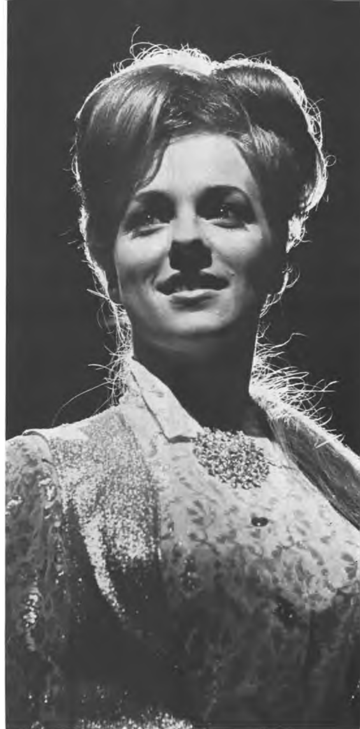
Lovely Connie Smith, as she appears in "Road To Nashville."