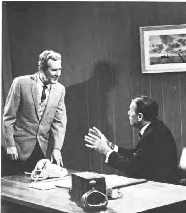
Doodles Weaver and Richard Arlen in scene from "Road To Nashville."