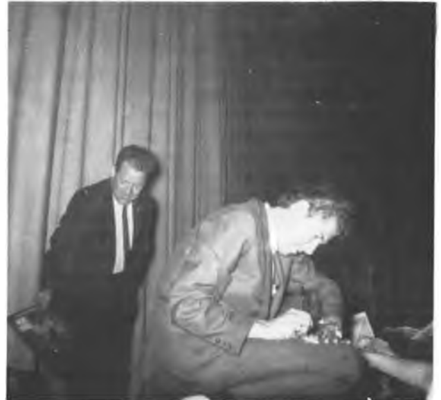
Signing autographs with a smile . . .