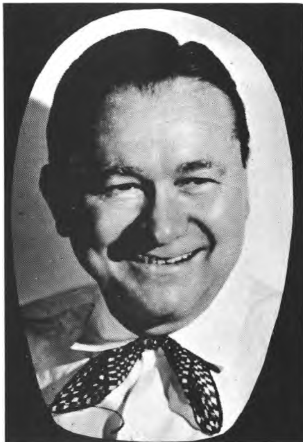
Tex Ritter, who gave Hank Thompson a helping hand by getting him a contract with a major recording studio—Capitol.

For more than the past dozen years Hank's well known Brazos Valley Boys have been the number one